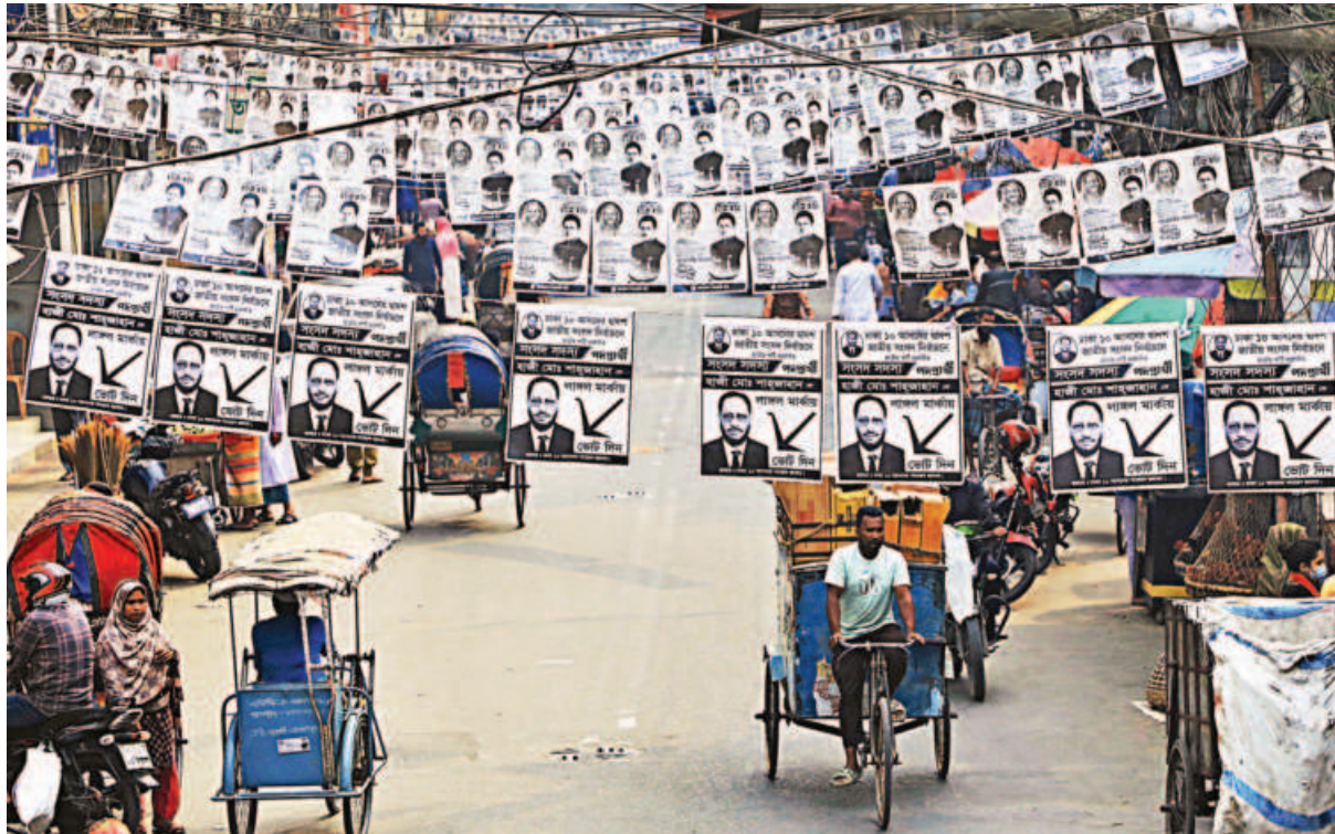
A road in the capital's Jhigatola is awash with posters of the candidates vying for Dhaka-10 seat as electioneering for the January 7 polls is going on in full swing. The photo was taken yesterday.