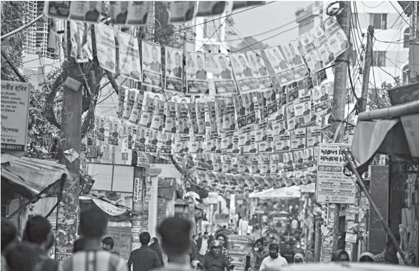
With electioneering underway at full throttle, Chattogram has turned into a city of posters. The photo was taken in Lalkhan Bazar area yesterday.

It is not clear whether the arrestees have any involvement with political parties, he said, adding that cases will be filed against them.