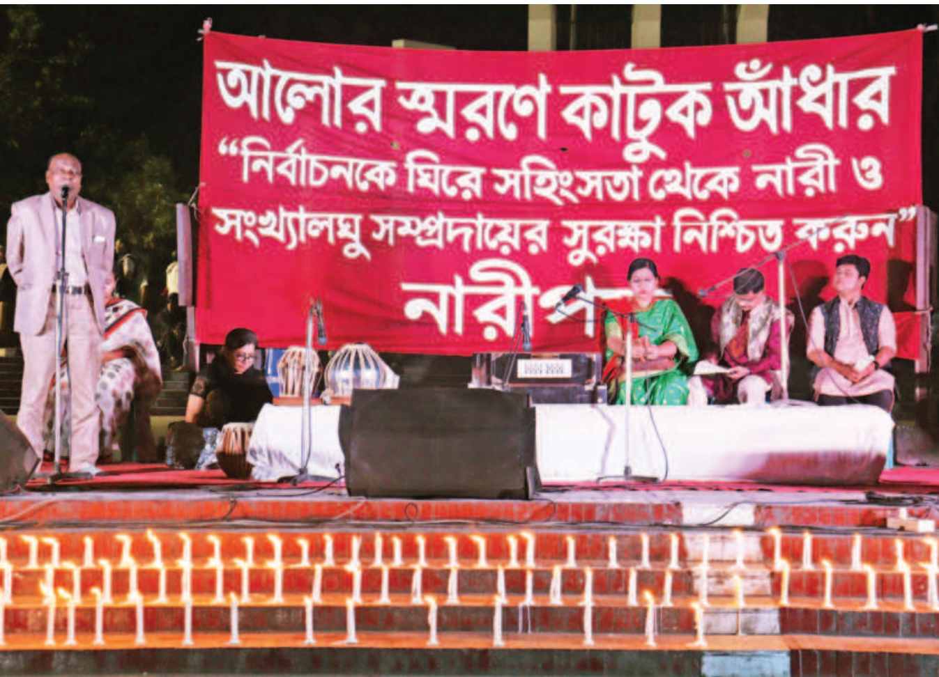
Women’s rights organisation Naripokkho demanded safety of women and minority communities during the upcoming national election at a programme at Central Shaheed Minar yesterday. As part of the event, they also held a cultural programme and lit up candles.