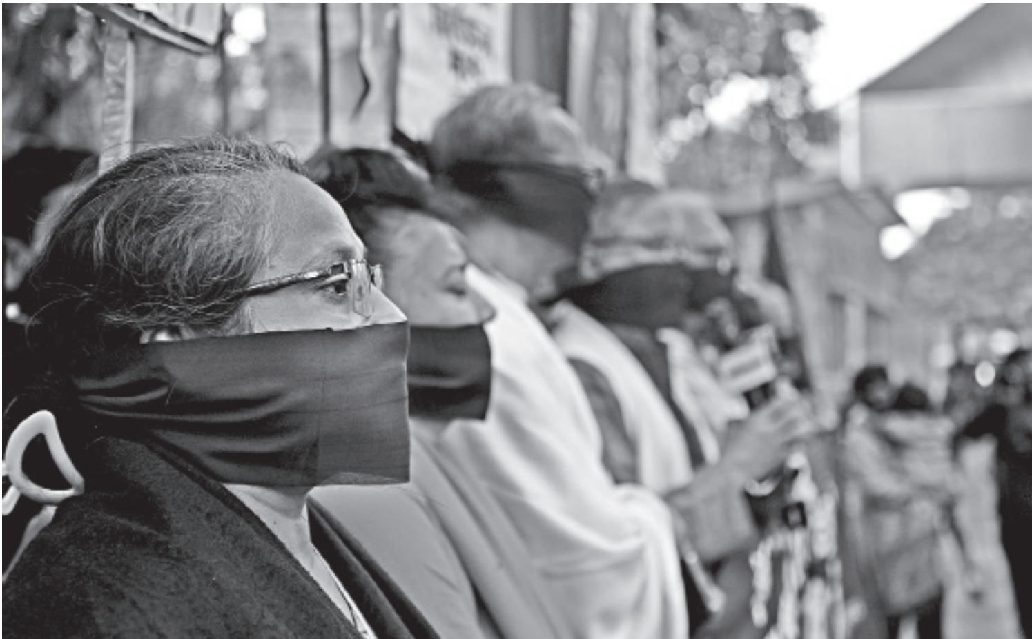
Covering their faces with black cloth, members of left-leaning political parties form a human chain in front of Jatiya Press Club yesterday, protesting the government ban on rallies and processions. Acting on an EC directive, the home ministry last week asked the authorities to take measures so that political programmes except electioneering do not take place from December 21 until the day of election.