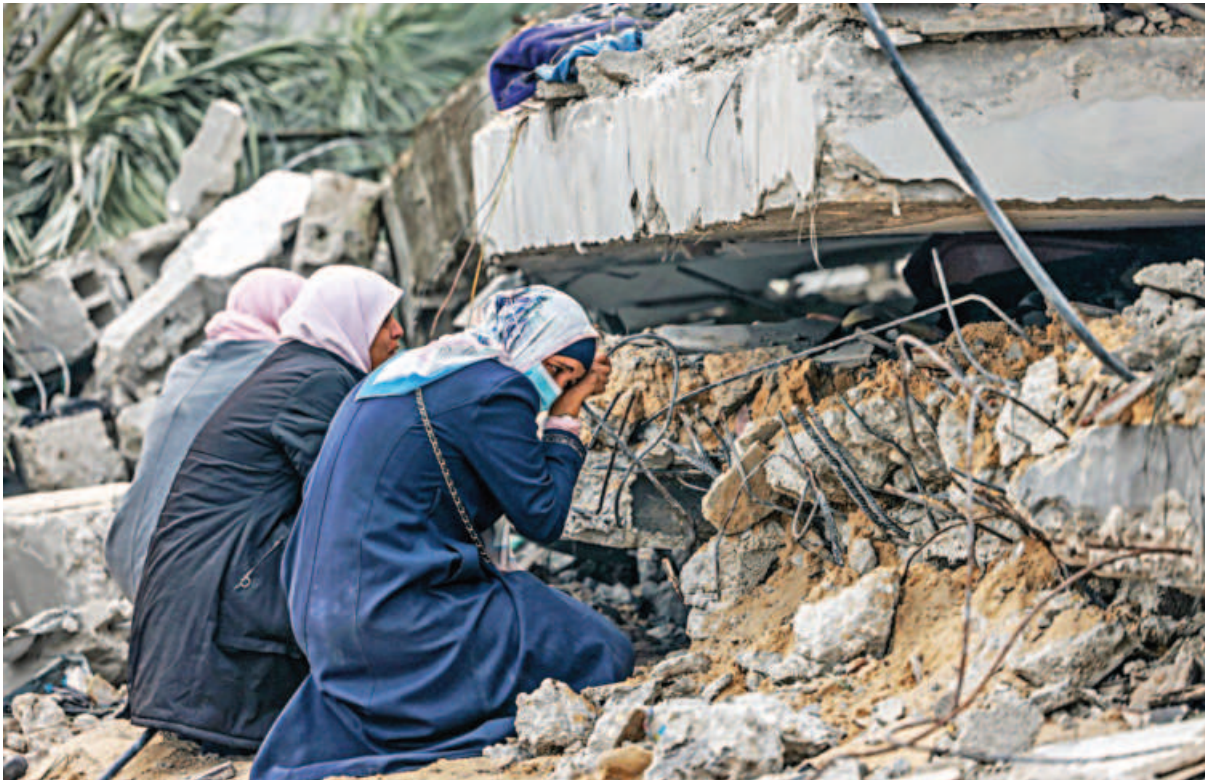
Palestinian women cry beside a collapsed building where one of their relatives is believed to be trapped in debris following Israeli bombardment in Rafah in the southern Gaza Strip yesterday.