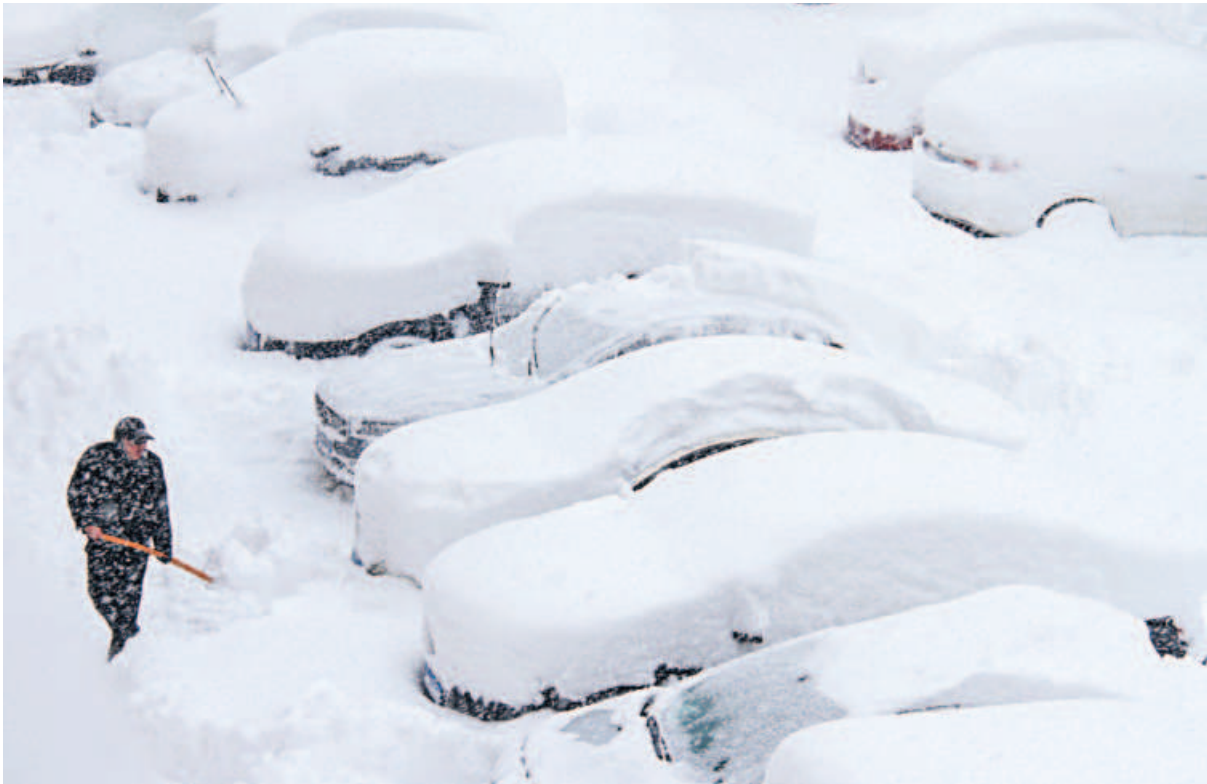
A man uses a shovel to clear snow during heavy snowfall in Weihai, in China’s eastern Shandong province yesterday. Temperatures in cities across northern China hit record lows on December 20, as authorities issued an alert for extreme cold across swathes of the country.

production facilities. Elsewhere, the chief of the Russian General Staff, Valery Gerasimov said that his country has established “comprehensive” defence cooperation with North Korea as well as continuing its strategic partnerships with India and China. “The course towards developing a comprehensive strategic partnership with China and India continues. Active, comprehensive cooperation has been established with the DPRK,” Gerasimov said in a year-end address. He gave no further details.