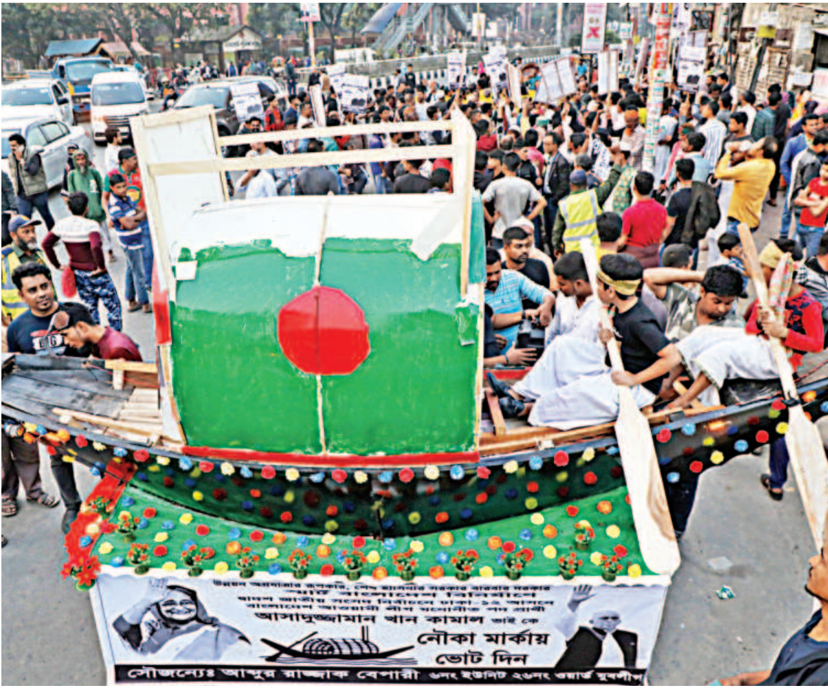
With a replica of a "boat" (the electoral symbol of Awami League) leading the way, AL supporters bring out a procession in the capital's Farmgate area yesterday in support of their candidate.