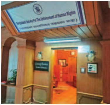
The office of Trinamool BNP on Topkhana Road.

No election activities visible in BNM, BSP, Trinamool BNP headquarters