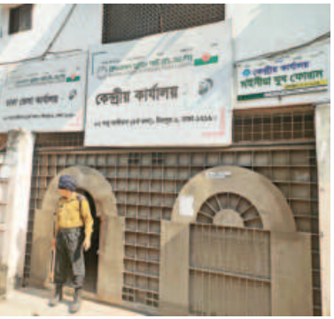
The "deserted" BSP office in Mirpur-1.

lines of nomination aspirants were seen in front of their office premises. But over the last two weeks, no senior leaders, activists, or candidates have been visiting the offices, said party insiders and locals. According to Election Commission data, 1,895 candidates will run in the upcoming parliamentary election. Of them, 133 are from Trinamool BNP, 79 from BSP, and 54 from BNM. The three parties have been registered with the EC during the tenure of the incumbent commission. During a visit to BNM's Gulshan-2 office around 11:00am on Tuesday, this correspondent found the main gate was locked, with no party members visible even after an hour of waiting.