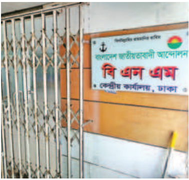
The locked BNM office in Gulshan-2.

A few months ago, much speculation surrounded the roles of "king's parties" (allegedly created or sponsored by strong actors to further their cause) in the upcoming national polls. However, as time progresses, it is becoming evident that these parties might be contesting the polls just for the sake of it. This newspaper found the offices of Bangladesh Nationalist Movement (BNM), Bangladesh Supreme Party (BSP), and Trinamool BNP deserted in a recent visit. At first glance, there is an apparent disconnect, with no visible signs of participation in an election less than a month away. However, the scenario was different a month ago, when long