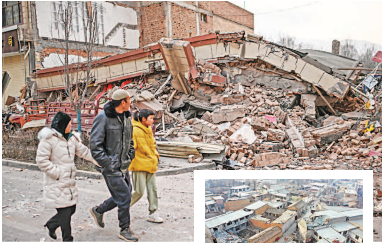
People walk past a collapsed building after an earthquake in Dahejia, Jishishan County in northwest China's Gansu province yesterday. Inset, this aerial photo shows damage after the earthquake yesterday.

Mishustin's visit to China yesterday and today comes two months after President Vladimir Putin made a rare trip outside Russia to meet Xi and a month after a senior Chinese general was hosted in Moscow.