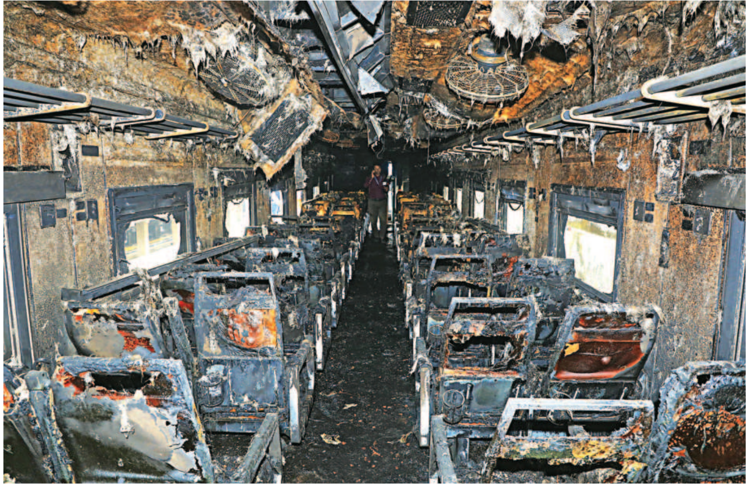
Charred interior of one of the three burnt carriages of Mohanganj Express. Officials say the fire that killed four people before daybreak was likely to be an act of arson as the BNP and several other parties enforced hartal yesterday.