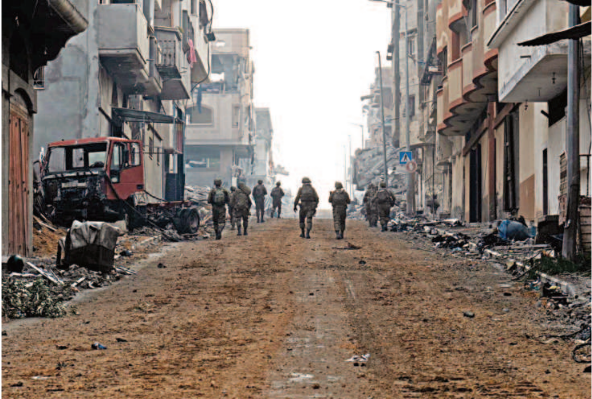
Israeli soldiers operate in the Gaza Strip amid the ongoing conflict between Israel and Hamas, in this handout picture released yesterday.