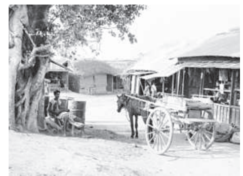
A beautiful capture of the rural beauty of Bangladesh.

"I took pictures of the Birmingham protests and my pictures were showcased in an exhibition in 2017, called the London 1971: Unsung Heroes of Bangladesh's Liberation War , convened by Ujjal Das. The exhibition was showcased at the British