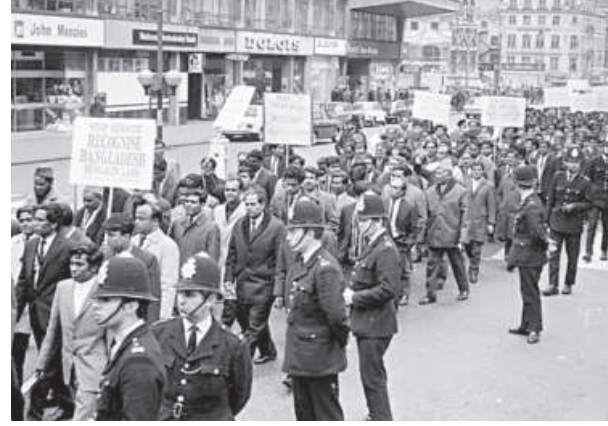
The Birmingham protest against Pakistani brutality and genocide in Bangladesh in 1971.