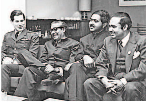
Sheikh Mujibur Rahman at the Claridges Hotel in London in 1972.