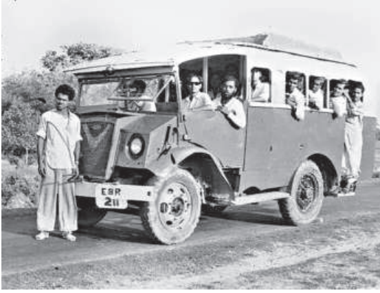
An old minivan takes ecstatic passengers towards their destination.