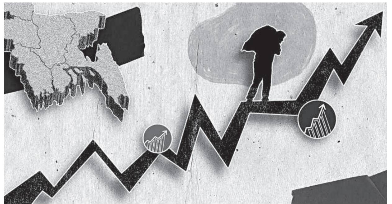
VISUAL: SALMAN SAKIB SHAHRYAR

A positive is that under the Recovery and Advancement of Informal Sector (RAISE) project, 30 welfare centres have been launched in 30 districts of the country, with the aim of reintegrating migrant workers who have returned from abroad. But the best initiative in 2023 for migrants has been the Probash scheme under the Universal Pension Scheme. Any expatriate Bangladeshi can participate in the Probash scheme by paying Tk 5,000, Tk 7,500 or Tk 10,000 in foreign currency as monthly instalments for at least 10 years. If a migrant pays Tk 10,000 monthly for 42 years, they will get a monthly pension of Tk 3,44,655. If they pay instalments for 30 years, they will get a monthly pension of Tk 1,24,660. The government has also