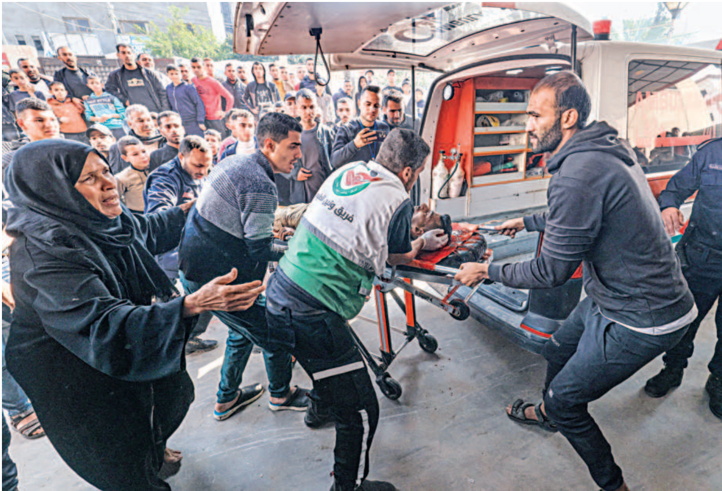
A woman laments as medics transport a Palestinian man injured in Israeli bombardment, at Nasser hospital in Khan Yunis in the southern Gaza Strip yesterday, amid ongoing battles between Israel and Hamas.

Approached for comment, the Israeli army said it was looking into the incident, which took place on the grounds of the Gaza Strip's only Catholic church.