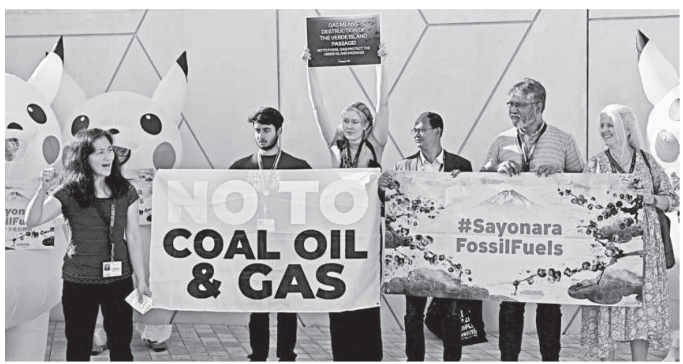
Activists take part in a protest against fossil fuel at COP28 in Dubai.

Beyond all these, there is also a strong fossil fuel lobby, which is active globally and even invaded the COP meetings in large numbers. According to an analysis of the Kick Big Polluters Out coalition, the