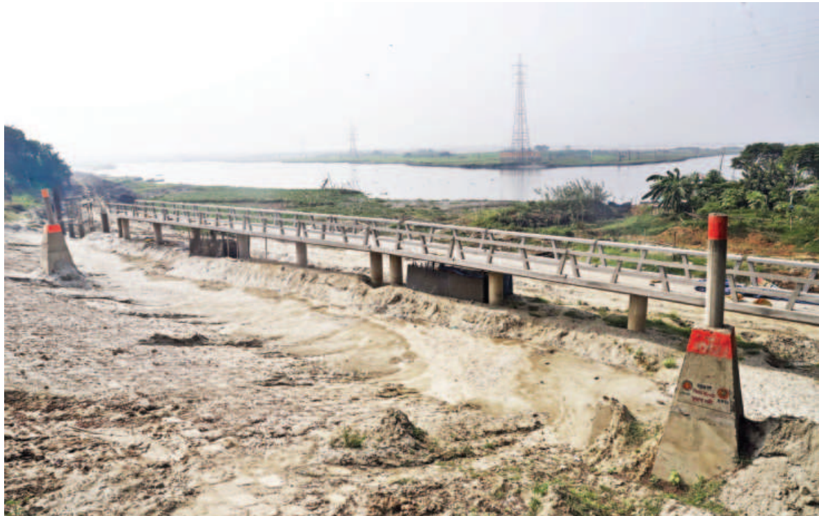
The BIWTA is building a walkway inside the area demarcated as the Turag river, violating a 2009 High Court directive on saving the rivers around the capital from encroachment. The photo was taken from Goran Chatbari near Mirpur Baribanh recently.