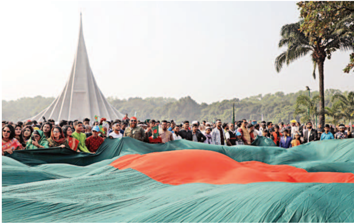
People hold on to a large national flag after paying respect to the martyrs of the Liberation War by laying flowers at the National Memorial in Savar to commemorate Victory Day yesterday.