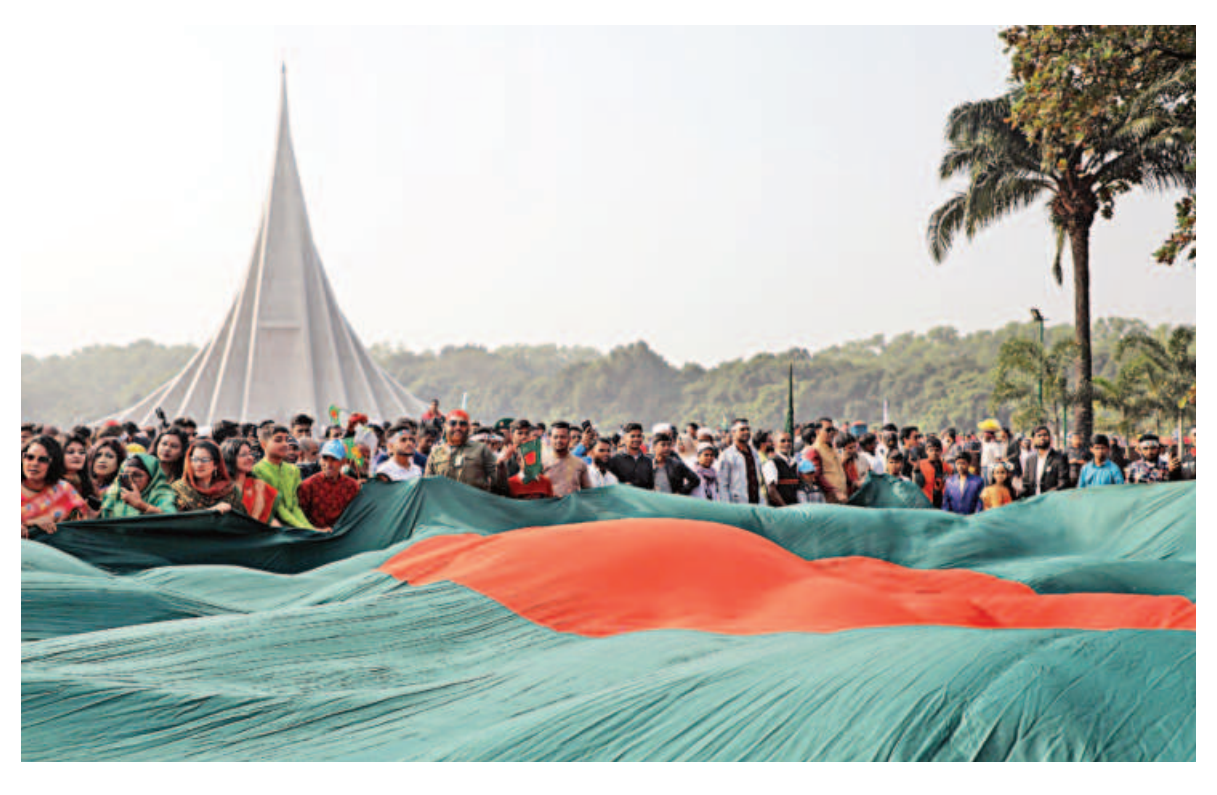
People hold on to a large national flag after paying respect to the martyrs of the Liberation War by laying flowers at the National Memorial in Savar to commemorate Victory Day yesterday.