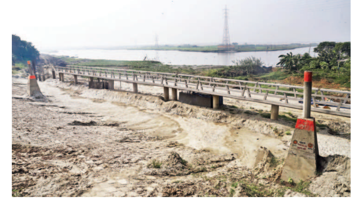
The BIWTA is building a walkway inside the area demarcated as the Turag river, violating a 2009 High Court directive on saving the rivers around the capital from encroachment. The photo was taken from Goran Chatbari near Mirpur Baribanh recently.