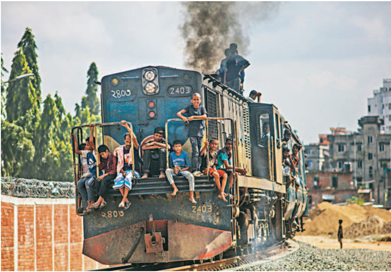
Passengers, mostly children, travel on the locomotive of a Dhaka-bound train from Narayanganj, putting their lives in harm’s way. The photo was taken in the capital’s Gendaria recently.