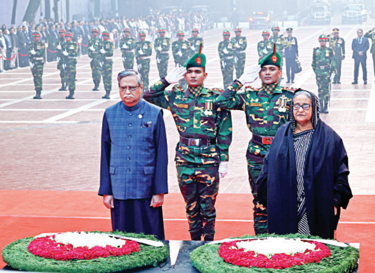
President Mohammed Shahabuddin and Prime Minister Sheikh Hasina stand in solemn silence after paying tributes to the martyred intellectuals, by placing floral wreaths at the Martyred Intellectuals Memorial in the capital's Mirpur yesterday morning. Family members of the martyred and freedom fighters also placed wreaths in Rayerbazar and Mirpur killing grounds. People from all walks of life joined in, wearing black as a symbol of mourning.