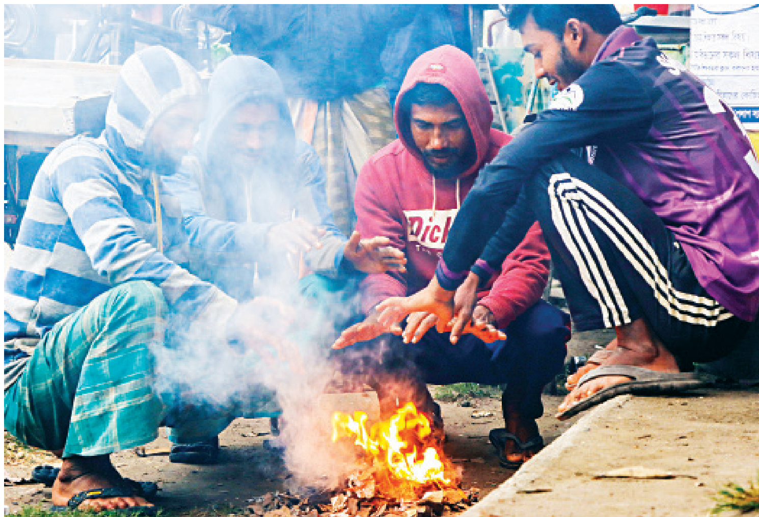
Four day labourers seek warmth by a fire amid dense fog at Boyra Aziz intersection in Khulna city yesterday morning.