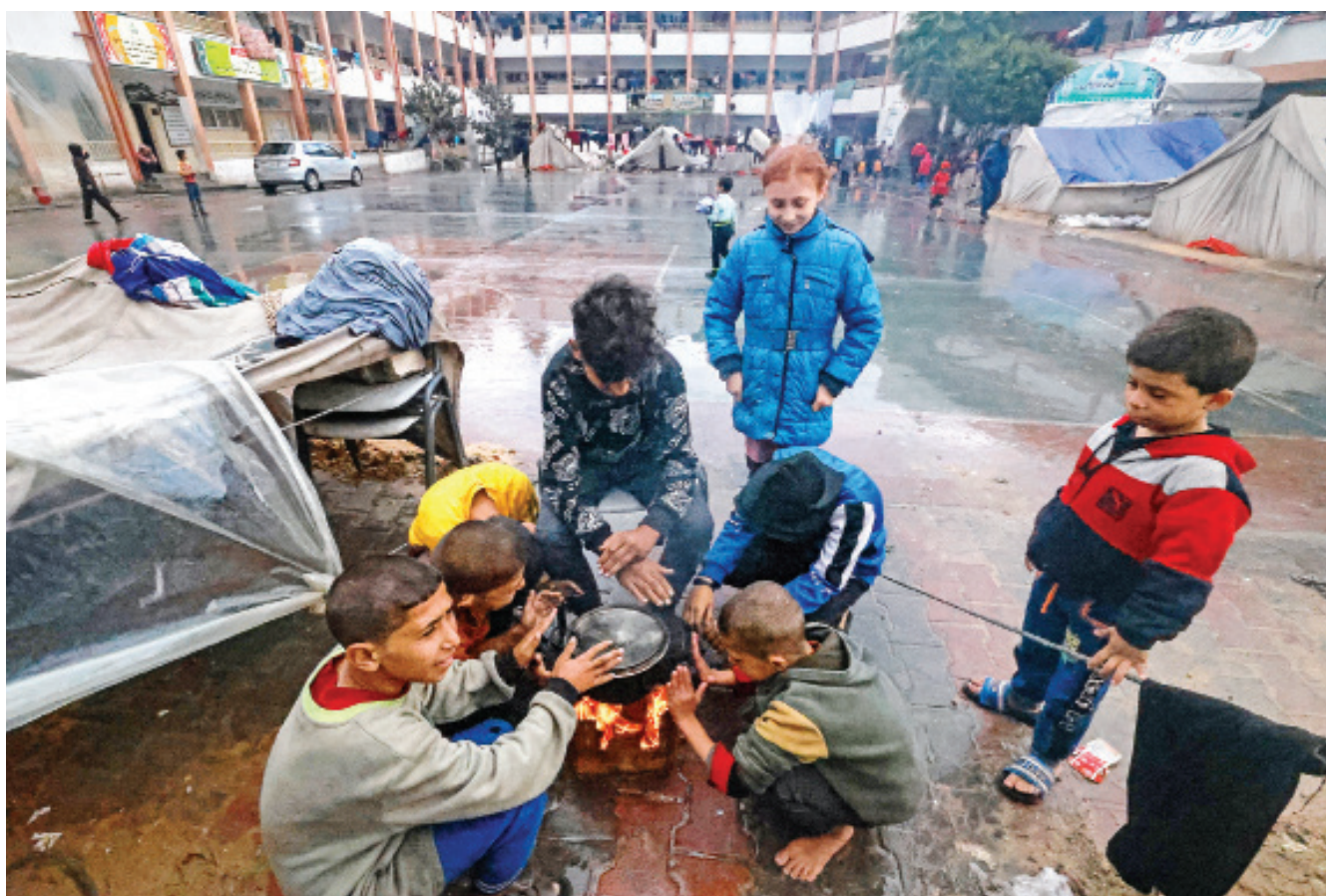
Palestinian children warm up around a fire outside their makeshift tent at a camp set up on a schoolyard in Rafah in the southern Gaza Strip, where most civilians have taken refuge, yesterday, as battles continue between Israel and Hamas.

The building, which dates to between the second half of the 2nd century BC and the end of the 1st century BC, is "an authentic treasure", Culture Minister Gennaro Sangiuliano said in a statement.