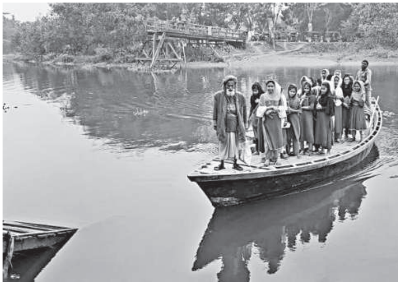
Students from the eastern side of the Sutabaria river take a dinghy to cross over to the western side to go to school while the only bridge connecting the two ends remains unrepaired.