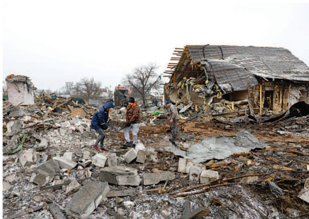
Local residents remove debris next to their neighbour's house, heavily damaged by a Russian missile strike, amid Russia's attack on Ukraine, in Kyiv, Ukraine yesterday. Ukraine downed eight Russian missiles targeting the capital Kyiv and another 18 attack drones over the rest of the country, the air force said.

The Himalayan region has two capitals, Jammu in winter, and Srinagar in summer. Indian Kashmir sprawls over 42,241 sq km. Before the region was split, its size of 222,236 sq km was slightly bigger than the US state of Utah and almost as big as Britain. The western Himalayan region is bounded by Pakistan to the west, Afghanistan to the northwest, China to the northeast, and India to the south.