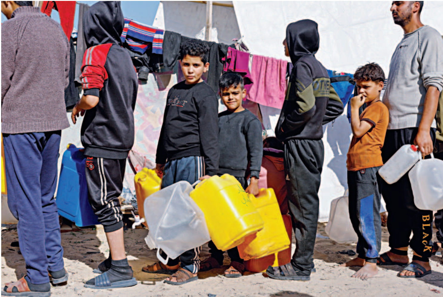
Boys hold containers while they line up, as displaced Palestinians, who fled their houses due to Israeli strikes, shelter in a tent camp near the border with Egypt, amid the ongoing conflict between Israel and Hamas, in Rafah in the southern Gaza Strip yesterday.

"We will target for our specific needs, for the agencies that I represent, 181 million of those 300," said UN aid chief Martin Griffiths.