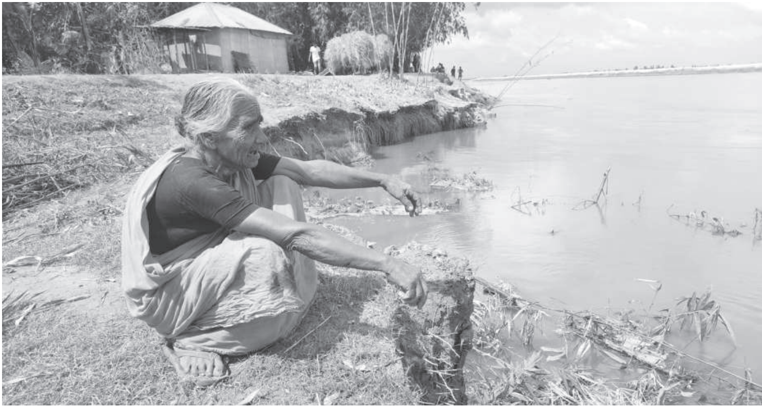
An old woman sits near the bank of the Teesta, grieving for what was once her home. Like her, river erosion has left 12,500 families homeless in the last 10 years in Lalmonirhat. With nowhere else to go, many have been forced to live on the streets or in homes constructed on WDB embankments.

"Our monitoring will continue. Additionally, efforts are going on to ensure that the prices of consumer goods do not increase under the pretext of reduced supply," he said.