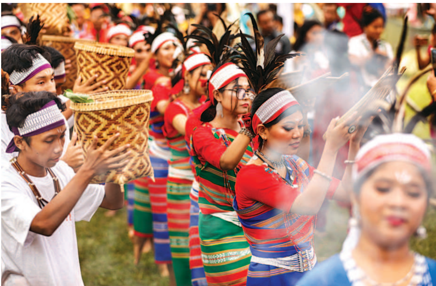
Dressed in traditional colourful clothes, Garo artists perform at Wangala Festival-2023 at the ground of Lalmatia Housing Society School and College in the capital yesterday. The Garo people organise this religious festival to express their gratitude to Misi Saaljong, the God of grains, for blessing the community with a good harvest.