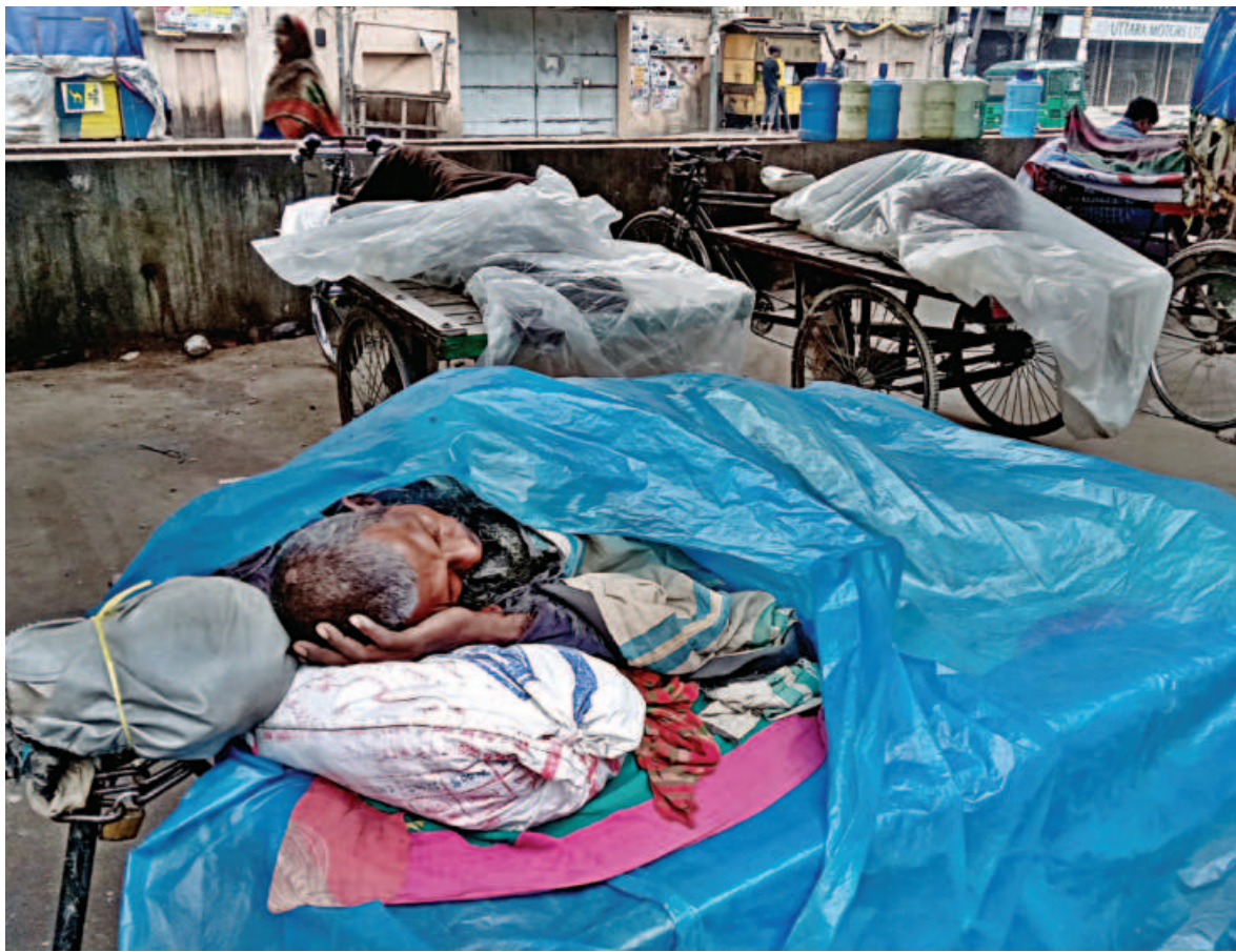
Rickshaw-van pullers, asleep under the Moghbazar-Mouchak Flyover around 7:00am yesterday, covered themselves with polythene sheets to protect against rain. Many low-income people in the capital spend their nights sleeping along roads.

In August, food inflation soared to 12.54 percent -- the highest since October 2011, when it stood at 12.82 percent,