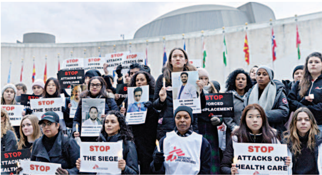
People affiliated with Doctors Without Borders/Medecins Sans Frontieres (MSF) hold signs during a vigil to honour colleagues and others who have been killed during the war in Gaza outside the United Nations Headquarters in New York City, US on Wednesday.

"We formed a three-member probe committee, which has been asked to submit a report in three working days," he said.