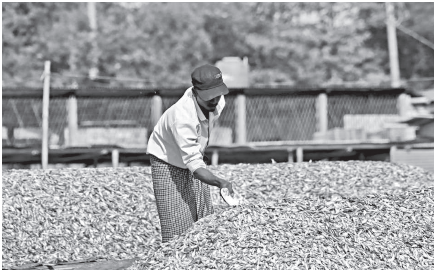
As waterbodies start to dry up in winter and small fish varieties start surfacing around the banks, dried fish producers in Lamakazi union of Sylhet's Bishwanath upazila set up stations in full swing. Around 70 such producers take up this temporary profession, employing around 1,500-2,000 workers who earn Tk 400-800 daily. Once dried, the fish, mostly comprising of tangra and puti, is bought by wholesale traders for Tk 18,000-30,000 per maund.

"Under this project, 25,000 tonnes of cashew nut will be produced annually after five years and the production will continue to increase," he said.