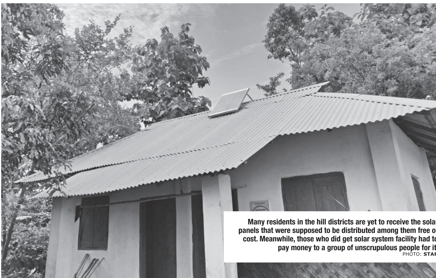
Many residents in the hill districts are yet to receive the solar panels that were supposed to be distributed among them free of cost. Meanwhile, those who did get solar system facility had to pay money to a group of unscrupulous people for it.