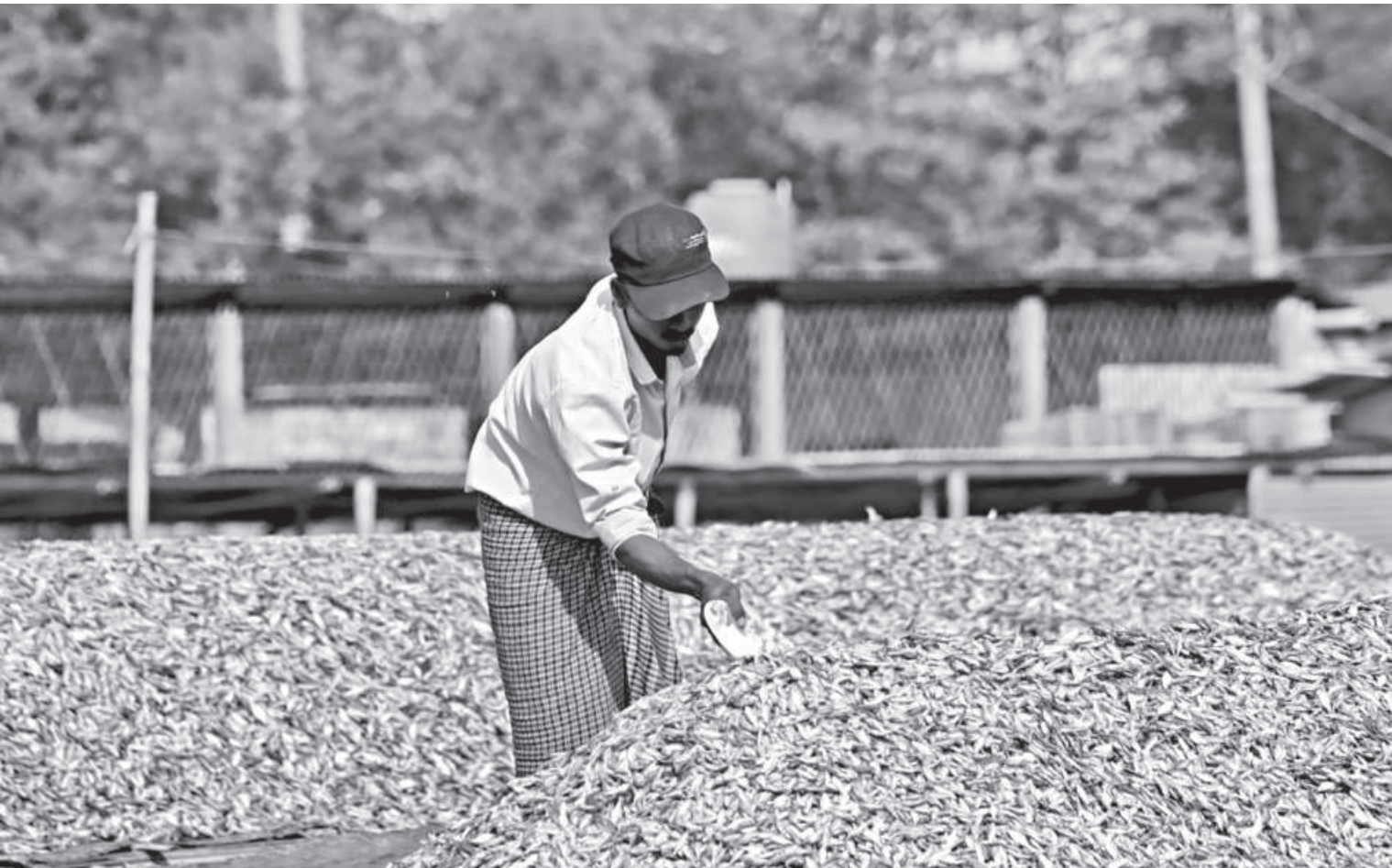
As waterbodies start to dry up in winter and small fish varieties start surfacing around the banks, dried fish producers in Lamakazi union of Sylhet's Bishwanath upazila set up stations in full swing. Around 70 such producers take up this temporary profession, employing around 1,500-2,000 workers who earn Tk 400-800 daily. Once dried, the fish, mostly comprising of tangra and puti, is bought by wholesale traders for Tk 18,000-30,000 per maund.

"Under this project, 25,000 tonnes of cashew nut will be produced annually after five years and the production will continue to increase," he said.