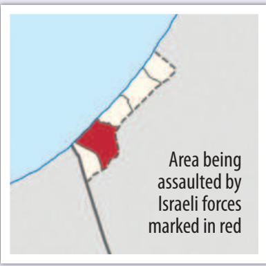
Area being assaulted by Israeli forces marked in red

Israel considers flooding Gaza tunnels with seawater: WSJ