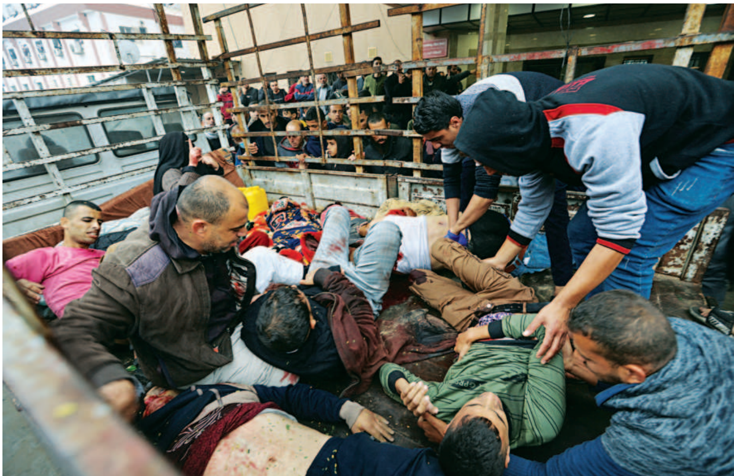
Wounded Palestinians are transported to Nasser Hospital following Israeli strikes, amid the ongoing conflict between Israel and Hamas, in Khan Younis in the southern Gaza Strip yesterday.

“A swarm of cheap drones can quickly drain the missile resource, leaving military assets and vehicles with depleted firing power for more combat-critical missions,” Nguyen said.