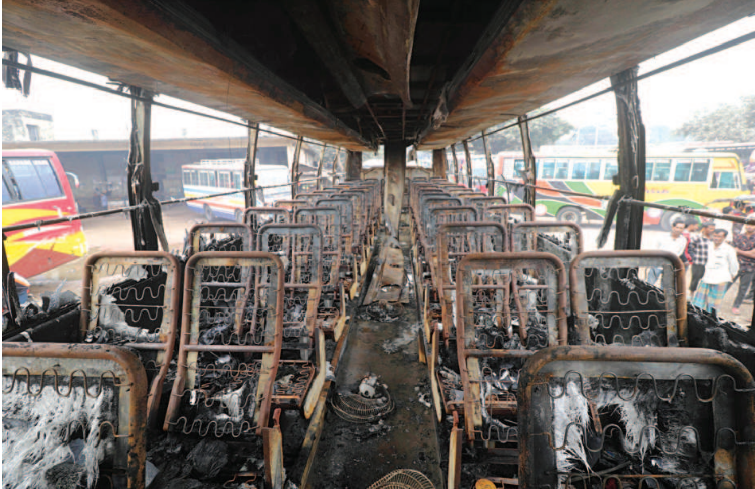
The charred interior of a bus at Dinaipur Bus Terminal. According to transport workers, the vehicle parked inside the terminal was set on fire by unidentified men around 2:30am yesterday.