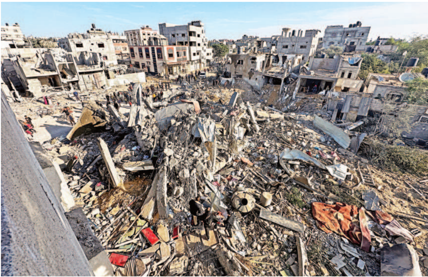
Palestinians gather at the site of an Israeli strike, amid the ongoing conflict between Israel and Hamas, in Rafah, in the southern Gaza Strip yesterday.