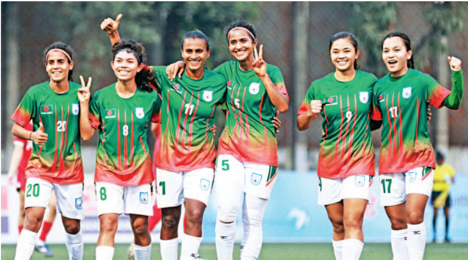
Bangladesh women's football team players pose for a photograph following their 8-0 thrashing of Singapore in the second FIFA Friendly match of the two-match series at the Birshreshtha Mostafa Kamal Stadium in Kamalapur yesterday. Story on Page 11.