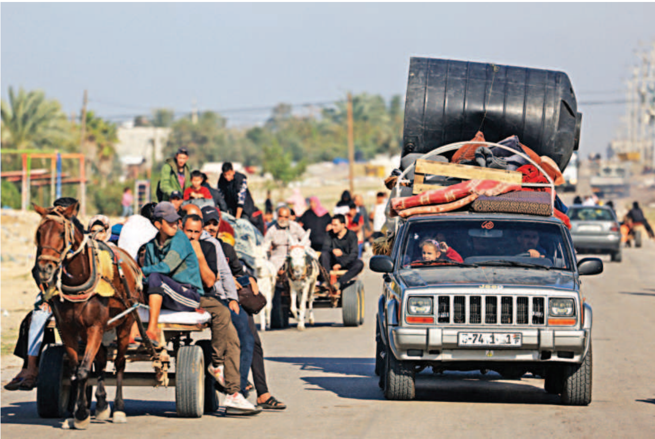
Palestinian civilians flee Khan Yunis in the southern Gaza Strip yesterday after the Israeli army called on people to leave certain areas in the city, as battles between Israel and Hamas continue.

The World Bank launched a program to explore possible support measures for public health in developing countries, where climate-related health risks are especially high. The burden of tropical diseases will worsen as the world warms, along with other climate-driven health threats including malnutrition, malaria, diarrhoea and heat stress. Many tropical diseases are already easy to treat. River blindness and sleeping sickness, for example, are both endemic to Africa and spread through parasitic worms and flies that are likely to proliferate in a warming world. More than 120 countries have signed a COP28 declaration acknowledging their responsibility to keep people safe amid global warming. The declaration made no mention of fossil fuels.