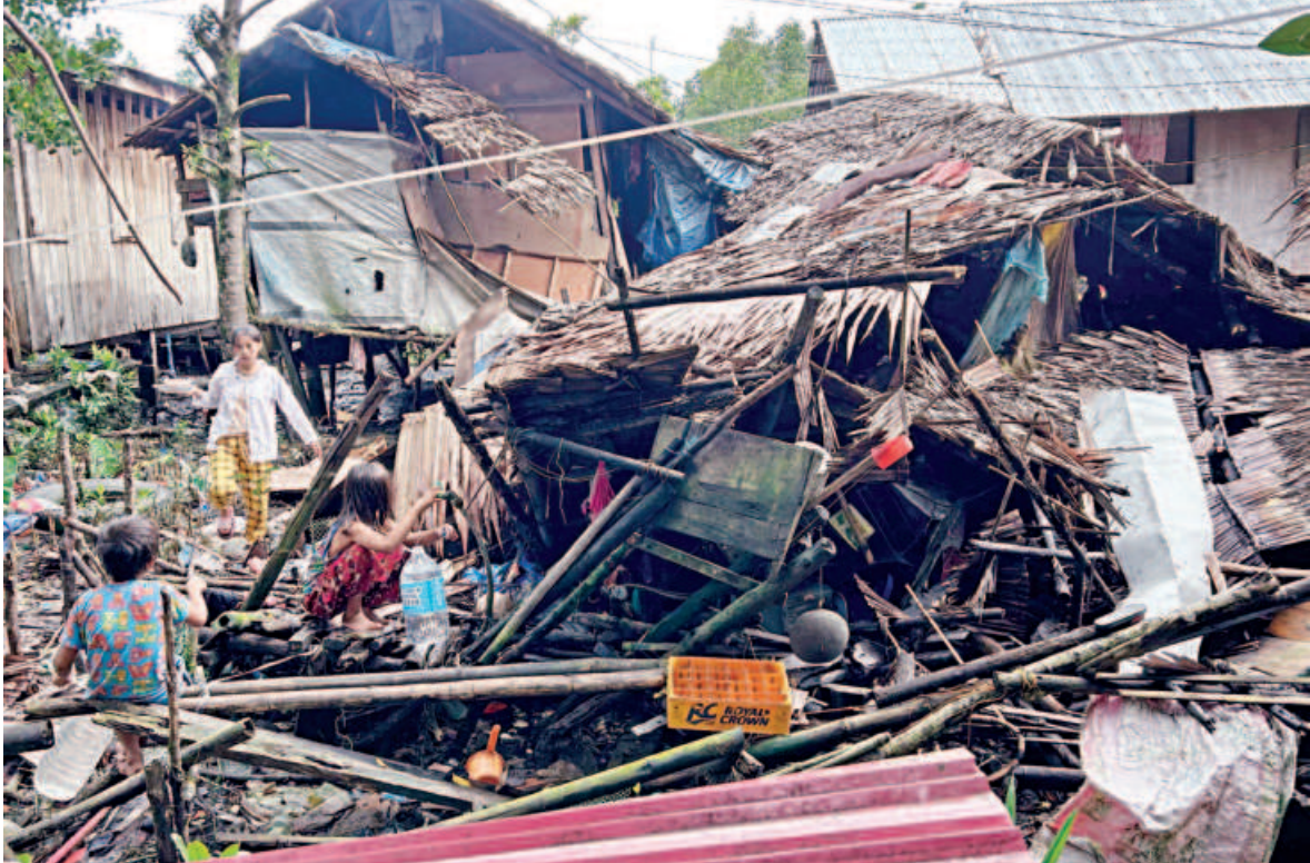
Residents fetch water next to a destroyed house in Hinatuan, Surigao del Sur province, Philippines yesterday, following a 7.6 magnitude earthquake late on Saturday. A second earthquake of 6.6 magnitude hit the southern Philippines yesterday, the US Geological Survey said.