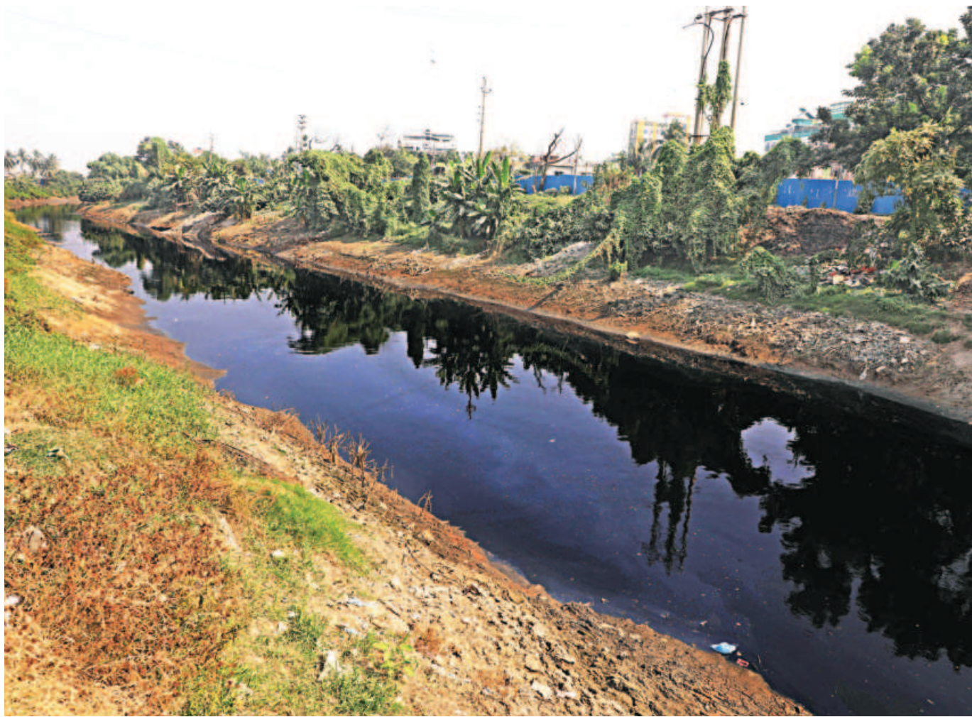
Due to discharge of effluents from dyeing factories in the area, the water of Kanchpur canal next to the Dhaka-Chattogram highway is dark and smelly. The polluted water flows directly into the Shitalakkhya nearby. The photo was taken yesterday.