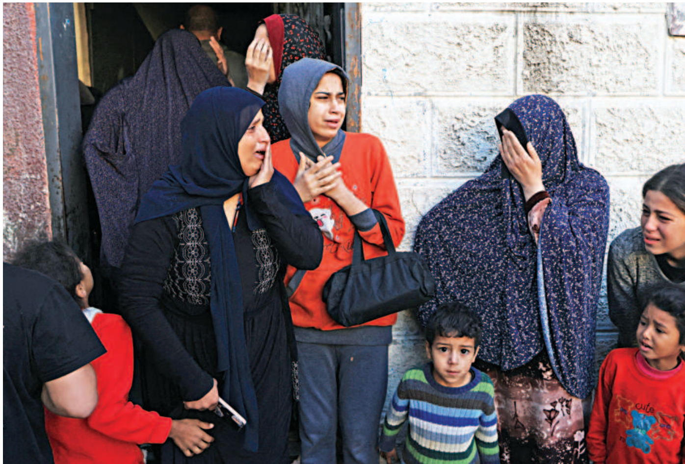
Women and children react after a house was hit by Israeli bombing in Khan Yunis in the southern Gaza Strip yesterday.