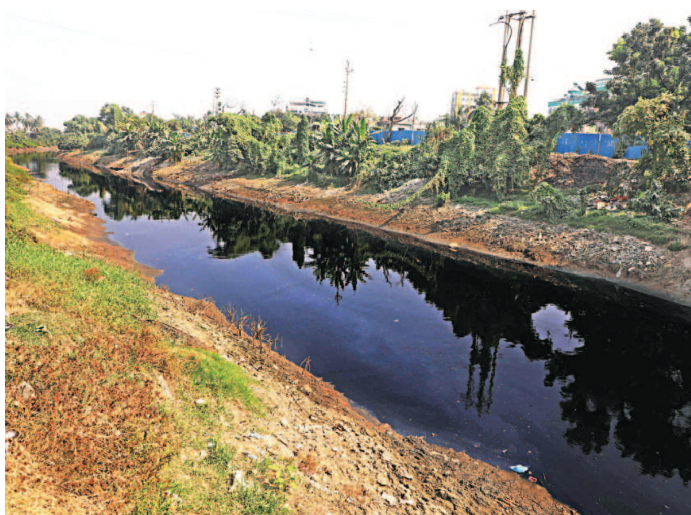
Due to discharge of effluents from dyeing factories in the area, the water of Kanchpur canal next to the Dhaka-Chattogram highway is dark and smelly. The polluted water flows directly into the Shitalakkhya nearby. The photo was taken yesterday.