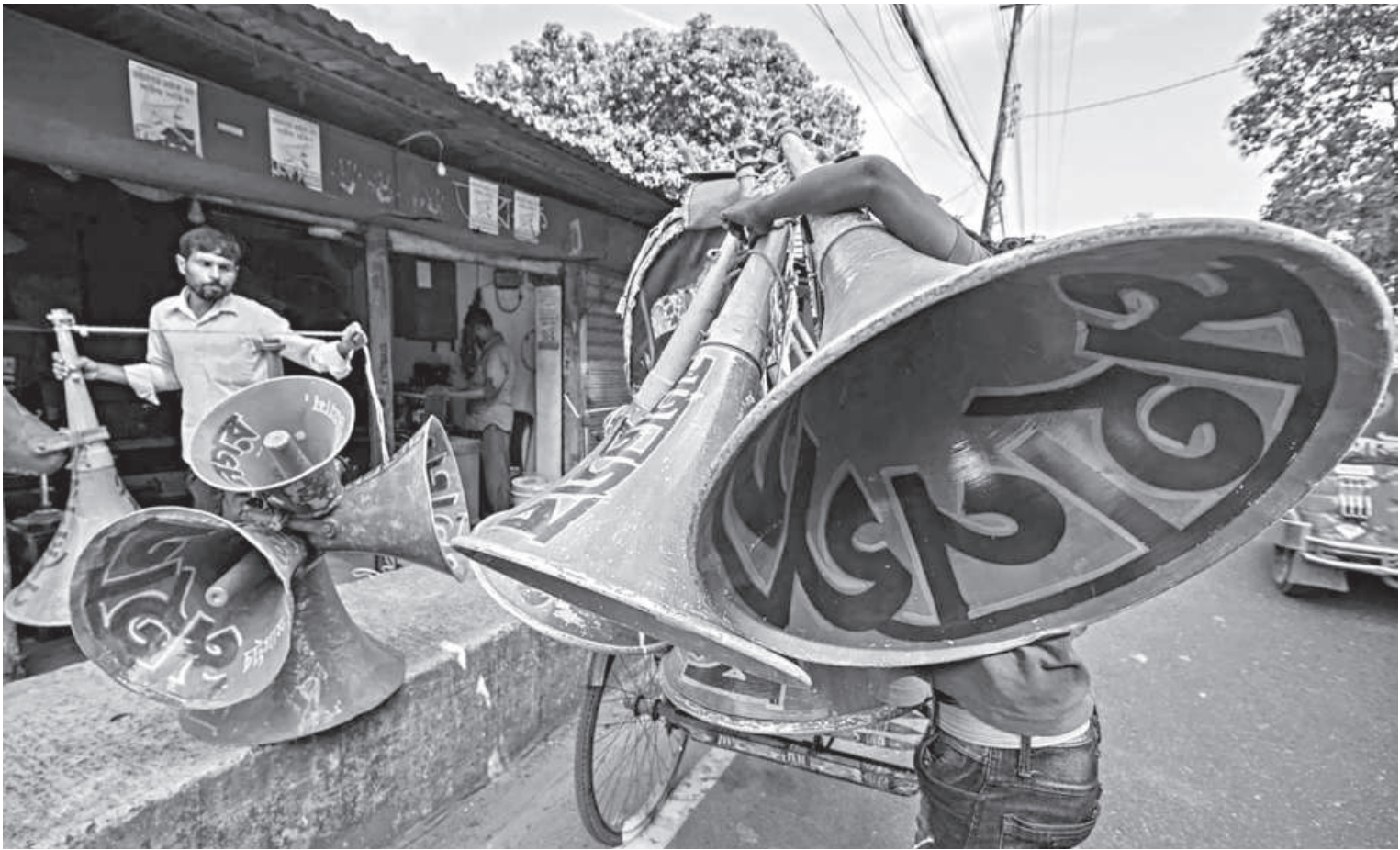
With national polls right around the corner, businesses renting out these loudspeakers are now on high demand. Besides, these sound carriers are the heartbeat of winter weddings and picnics. The photo was taken from the port city's Ice Factory area yesterday.

They also found that over 200 workers have been arrested and over 34,000 have been charged in at least 62 cases related to the garment workers' wage hike movement.