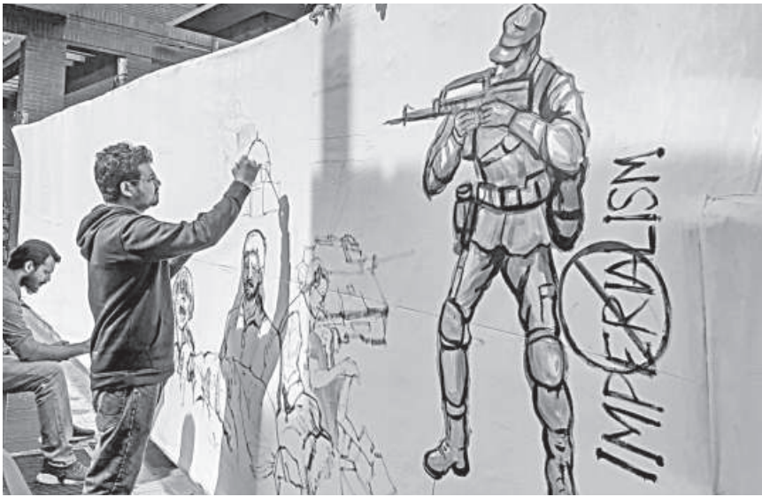
ARTISTS AGAINST IMPERIALISM... An art exhibition was held at the Shilpakala Academy in Khulna yesterday. Around 40 artists took part in the event and protested against injustice through colours and brushes.

The camp introduced a national adolescent health website and mobile app. It conducted basic physical examinations and provided awareness on sexual and reproductive health, nutrition, child marriage, hygiene, and mental health among students of class VI to X. It was organised with the technical support of Unicef Bangladesh. The initiative was also supported by the Directorate General of Family Planning, DGHS, and Ministry of Education.