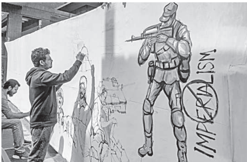
ARTISTS AGAINST IMPERIALISM... An art exhibition was held at the Shilpakala Academy in Khulna yesterday. Around 40 artists took part in the event and protested against injustice through colours and brushes.

The camp introduced a national adolescent health website and mobile app. It conducted basic physical examinations and provided awareness on sexual and reproductive health, nutrition, child marriage, hygiene, and mental health among students of class VI to X. The camp was organised with the technical support of Unicef Bangladesh. The initiative was also supported by the Directorate General of Family Planning, DGHS, and Ministry of Education.