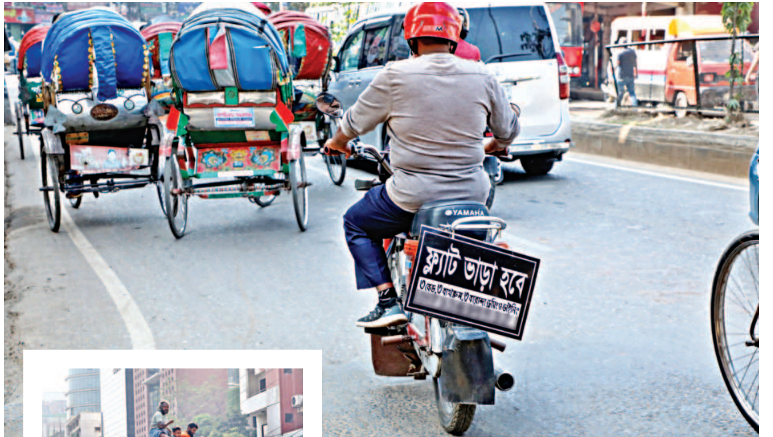
This biker has found a new way to advertise an apartment for rent by placing the ad on the back of his motorbike as he roams around the city on it. Inset, Dhaka dwellers mostly shift apartments during yearend and scenes like a truck full of household belongings moving on Dhaka roads become a common sight in December. The photos were taken in Mohammadpur and Dhanmondi areas respectively.