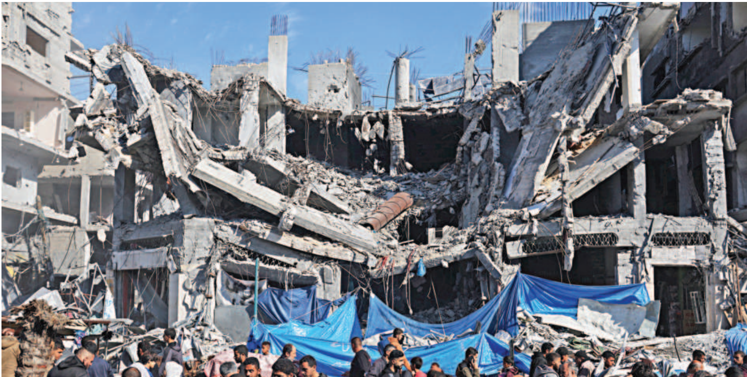
Palestinians shop in an open-air market near the ruins of houses and buildings destroyed in Israeli strikes during the conflict, amid a temporary truce between Hamas and Israel, in Nuseirat refugee camp in the central Gaza Strip yesterday.