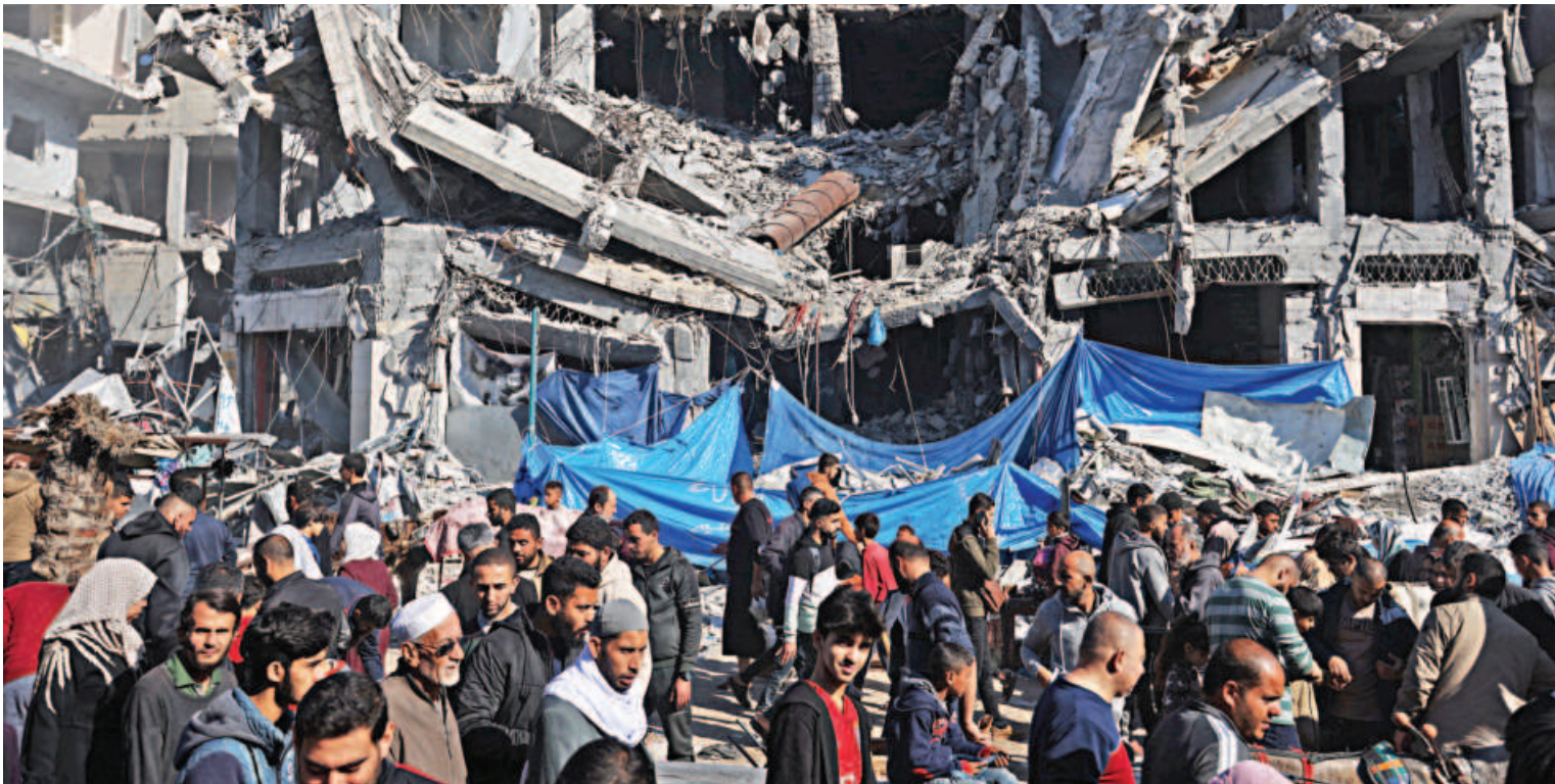
Palestinians shop in an open-air market near the ruins of houses and buildings destroyed in Israeli strikes during the conflict, amid a temporary truce between Hamas and Israel, in Nuseirat refugee camp in the central Gaza Strip yesterday.