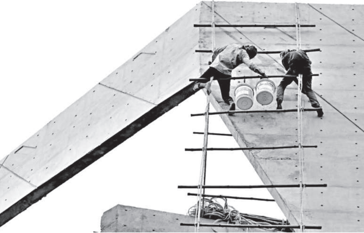
Safety precautions are frequently ignored in the construction sector since owners, contractors, and workers lack knowledge and training or are careless.