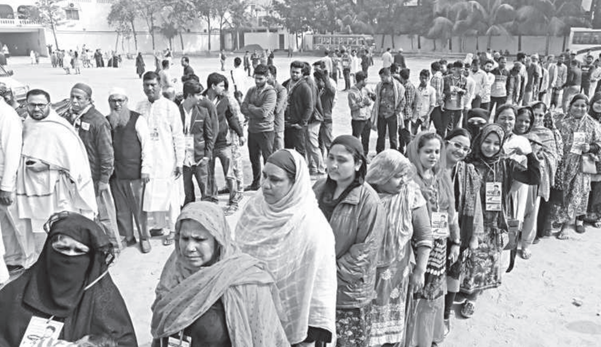
What's worrying is that an entire generation has grown up without being accustomed to the actual exercise of elections.

We have to keep in mind that youths have been missing out on being part of the democratic process, the voting environment, and rights. They need to connect with a mainstream political process that accommodates diverging and opposing views. There must be a healthy debate of conflicting ideas to enlighten the youth. Otherwise, there won't be any progress.