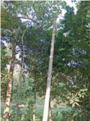
During a recent visit, it was seen that the REB is already preparing to connect power lines through the forest, with some electric poles set up there.