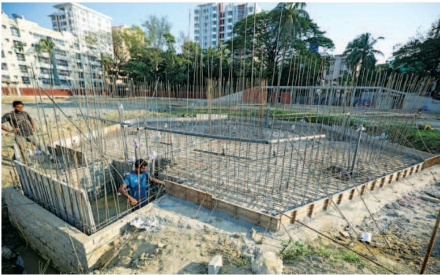
Established by PWD in 1964, the 59-year-old park, built on 2.17 acres of land, is one of the few parks in the port city freely accessible to people.

During a recent visit, the site area was seen covered with corrugated iron sheets, with some 20 workers inside. The boundary wall has been constructed, while two swimming pools have been