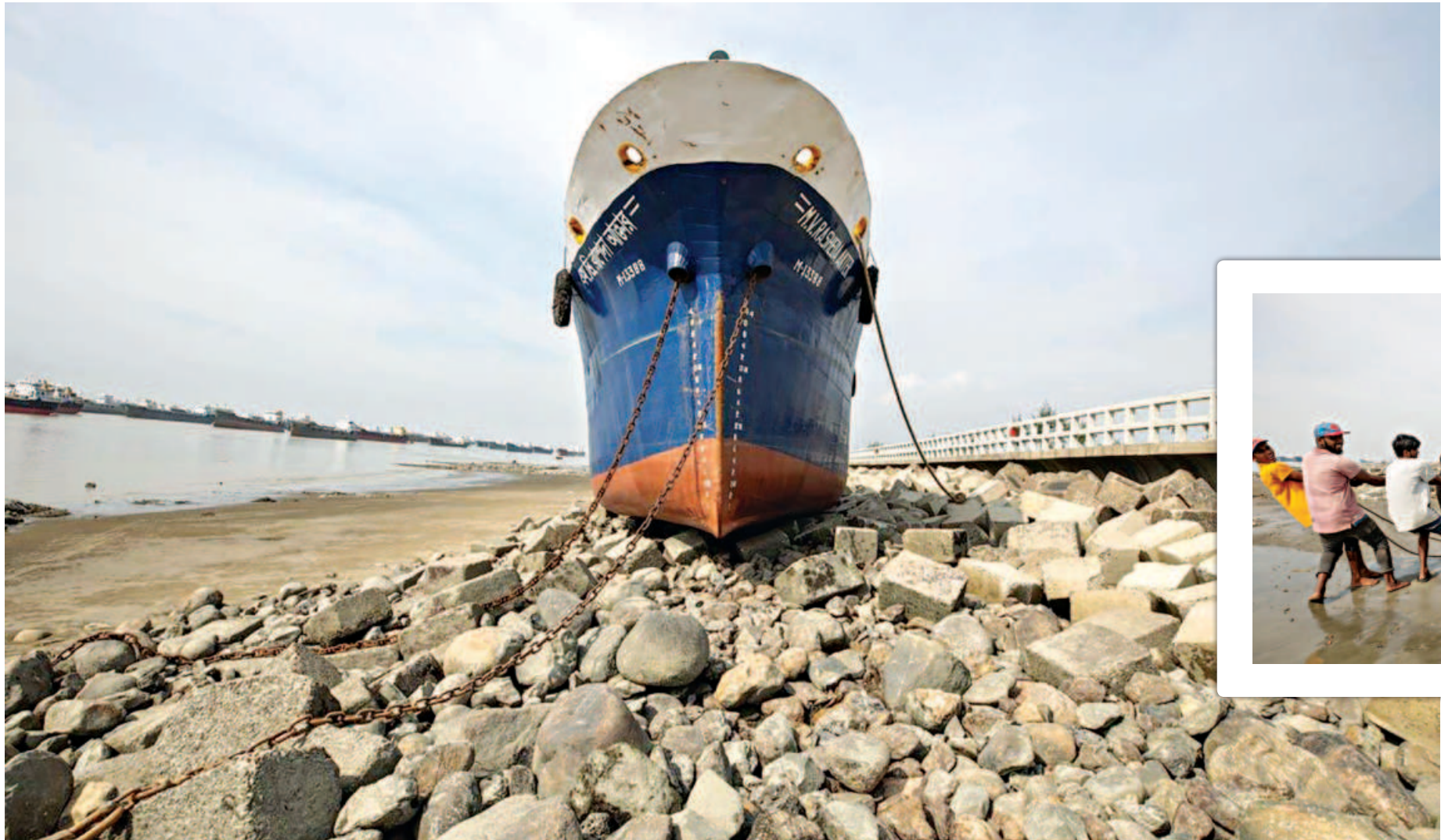
At least 30 vessels ran aground in different areas on Patenga seashore during Cyclone Midhili last Friday. The MV Rasheda Akter was the most affected one and needed towing down after it got stuck at a high level of the stone embankment and could not be steered back into the water so far during high tide.