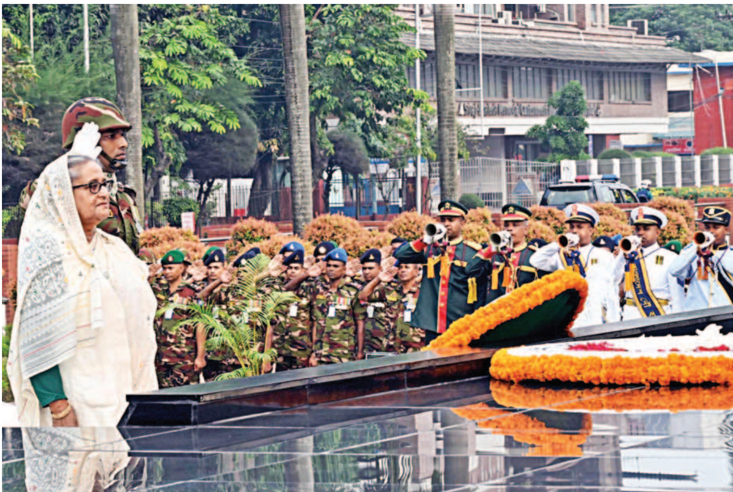
Prime Minister Sheikh Hasina pays tribute to the martyred members of Bangladesh Armed Forces at the Shikha Anirban (flame eternal) in Dhaka Cantonment yesterday morning.