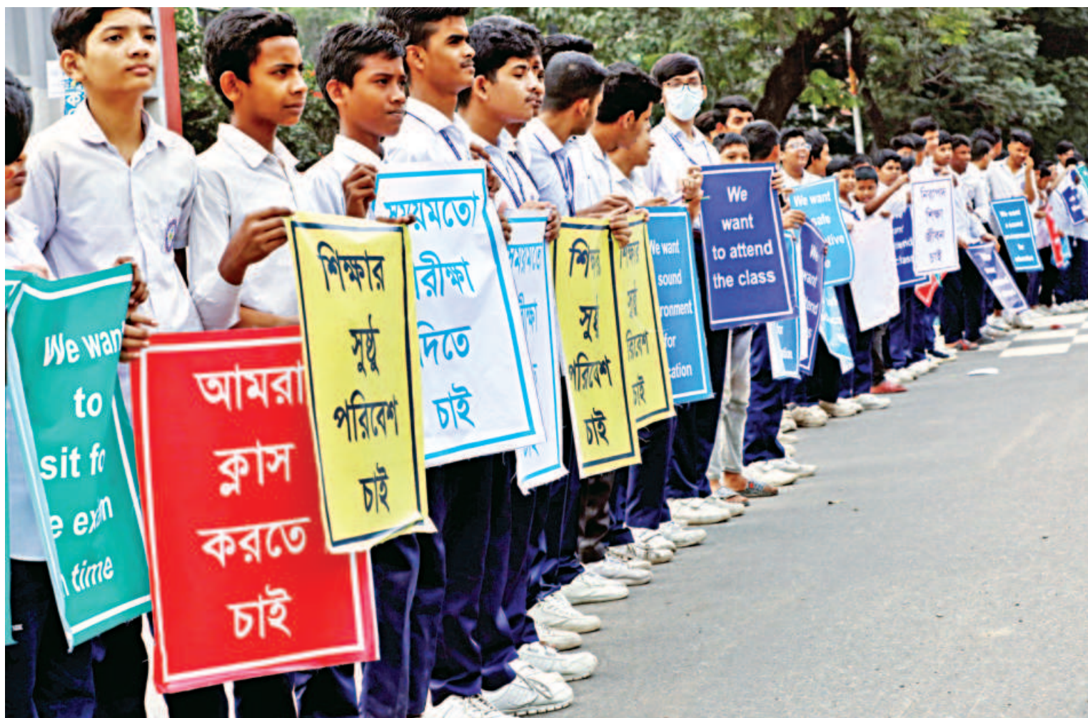
Holding posters and banners, students from several educational institutions formed human chains yesterday, demanding timely examinations and a safe learning environment. This photo was taken on Manik Mia Avenue.