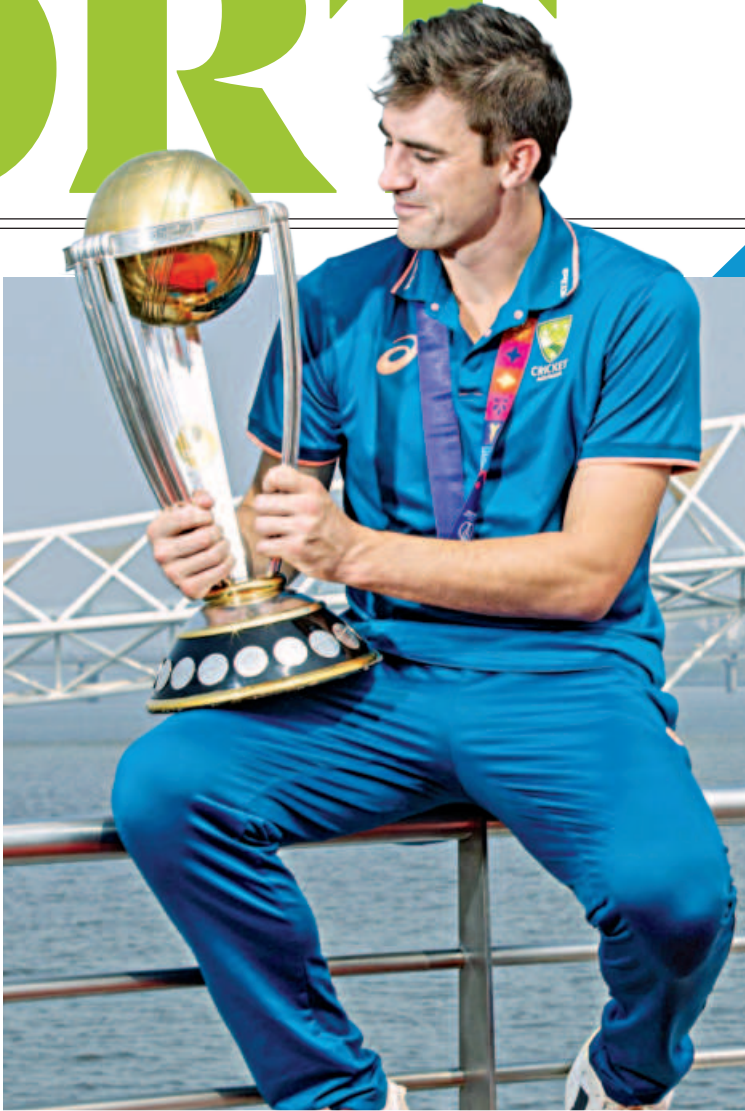
Australia skipper Pat Cummins poses with the coveted trophy at the Atal Pedestrian Bridge on the Sabarmati river in Ahmedabad on Monday, a day after leading his side to their sixth World Cup triumph with a convincing six-wicket win over hosts India at the Narendra Modi Stadium.