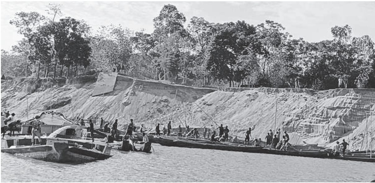
Numerous engine-run boats carry sand and stones, collected from the riverbed of the Jadukata in Sunamganj's Tahirpur upazila, amid the absence of monitoring. According to locals, the activities are backed by locally influential people. The photo was taken recently in Ghagtia area of the upazila's Badaghat union.