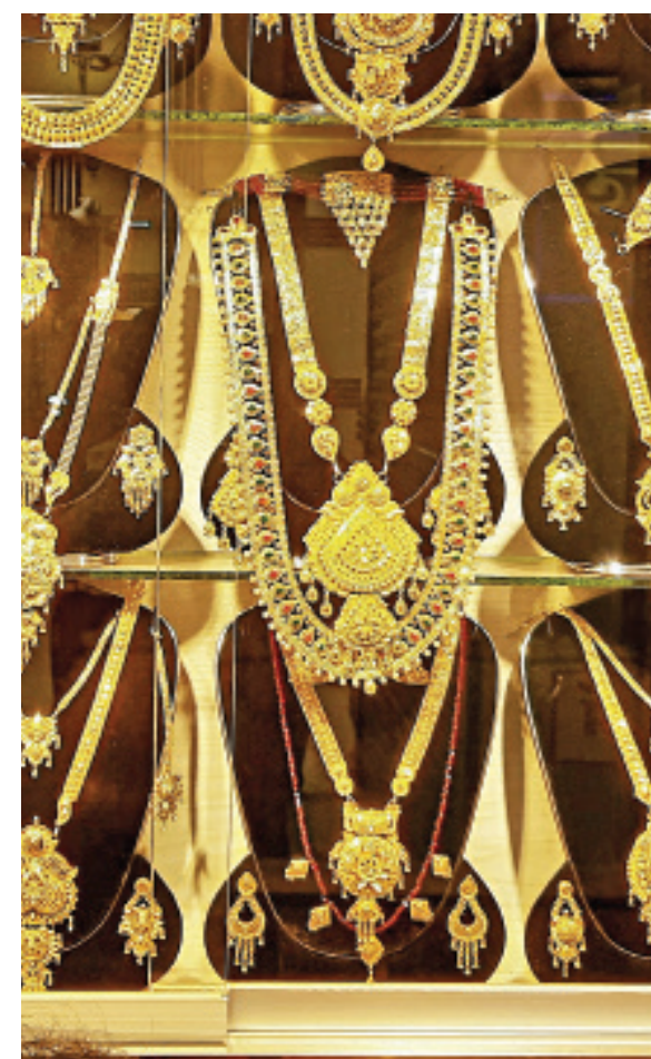
In July, gold price crossed the Tk 1 lakh-mark per bhoori for the first time in Bangladesh. The photo was taken from Khulna city last night.