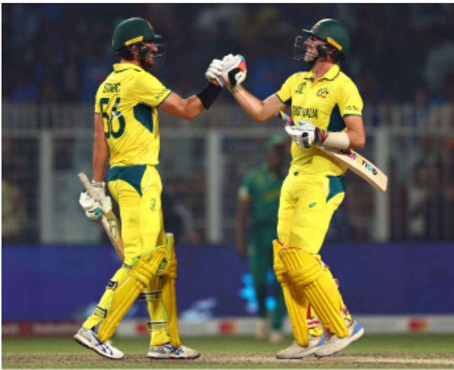
Australia captain Pat Cummins celebrates hitting the winning boundary with Mitchell Starc as the five-time World Champions had to dig deep for their three-wicket win in the World Cup semifinal against South Africa in Kolkata yesterday. The Aussies will face hosts India in the final in Ahmedabad on November 19.