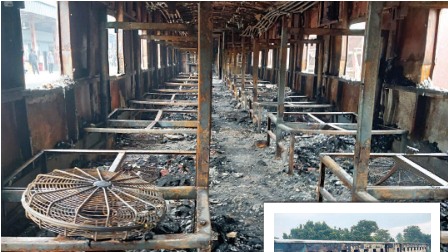
A charred carriage of a commuter train at Gharinda Railway Station in Tangail sadar upazila. Three carriages of the stationary train, which runs between Dhaka and Tangail, were damaged in a fire early yesterday. Police suspect arson.

If the major parties remain unyielding, there will be further instability and confrontations, and the already crisis-ridden economy will suffer.