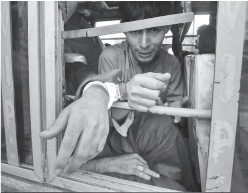
Afghan nationals, who according to police were undocumented, are handcuffed as they are detained and shifted to a holding centre, after Pakistan gave the last warning to undocumented migrants to leave by November 1.

However, many politicians and civil society and human rights organisations