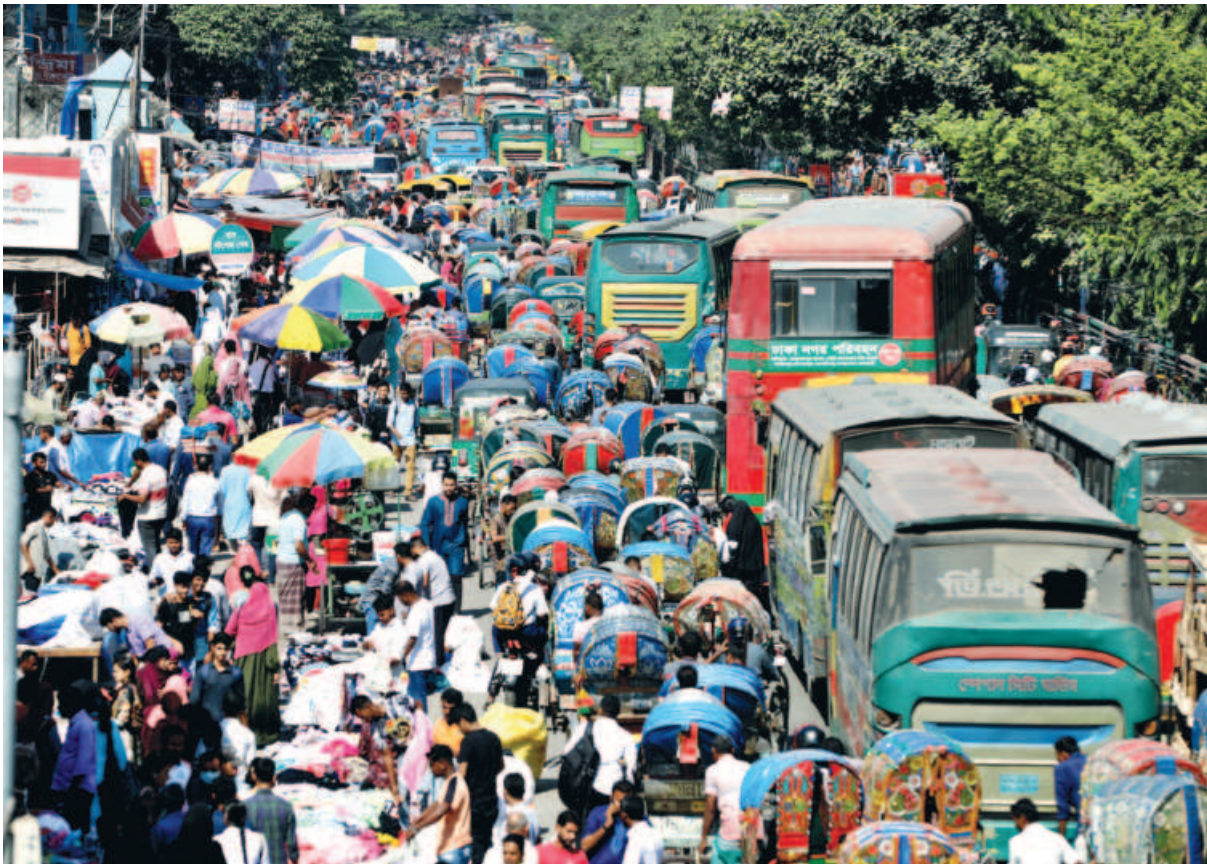
After wearing a deserted look for the last few days, a long tailback was seen on Mirpur Road in the capital's New Market area amid blockade yesterday afternoon.