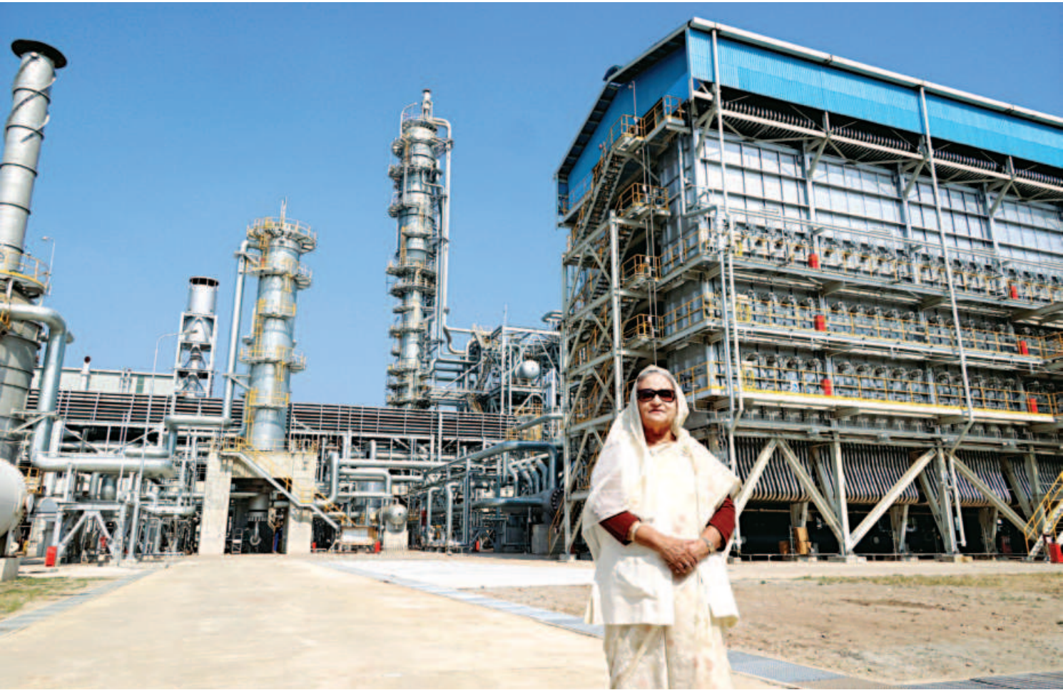
Prime Minister Sheikh Hasina stands in front of the newly-constructed Ghorashal-Palash Urea Fertiliser Factory in Narsingdi. The premier inaugurated the factory, the largest of its kind in Southeast Asia, yesterday.