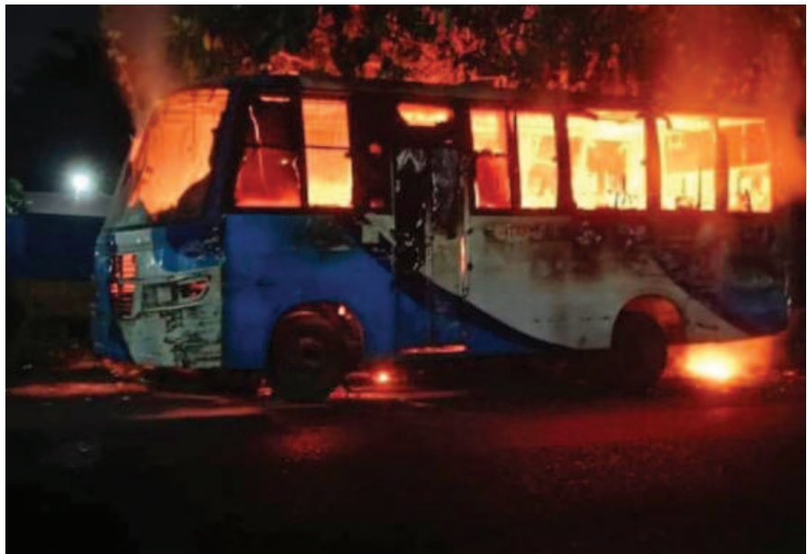
A arsonists set fire to a parked bus of Naf Paribahan in the Godnail area of Narayanganj's Siddhirganj around 6:30pm yesterday.