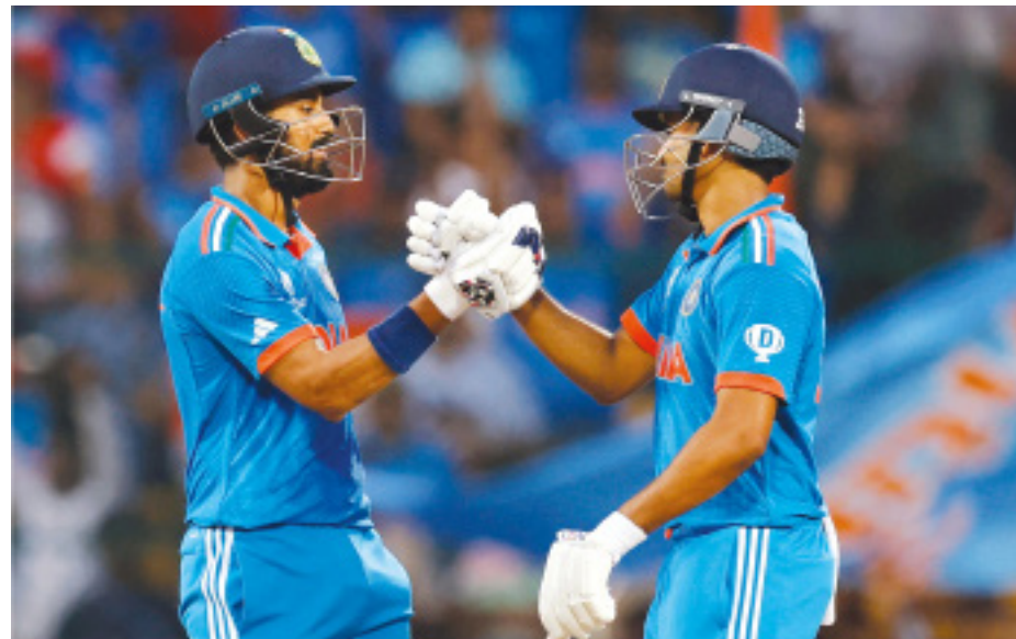
India's KL Rahul celebrates with Shreyas Iyer after reaching his century in the last World Cup group-stage game against the Netherlands at the M Chinnaswamy Stadium in Bengaluru yesterday.