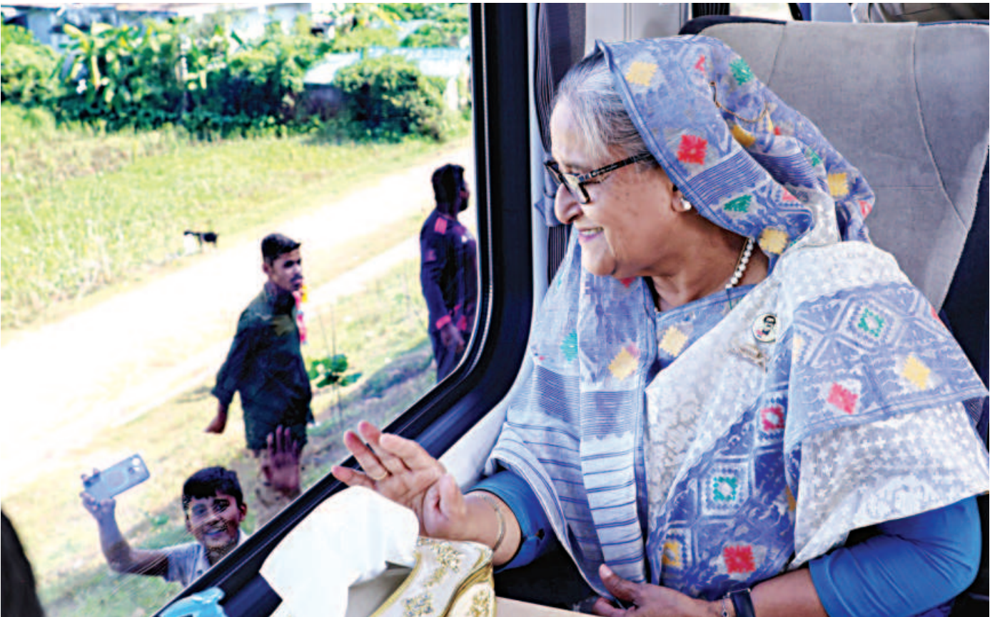
Prime Minister Sheikh Hasina waves at locals who gathered along the rail line to greet her on her way to Ramu from Cox's Bazar by a train yesterday.

The EU is Bangladesh's largest export destination: total exports to the EU amounted to €24 billion in 2022. The EU has been providing Bangladesh duty-free access to its market while also helping improve safety in the RMG sector since the Rana Plaza collapse in 2013.